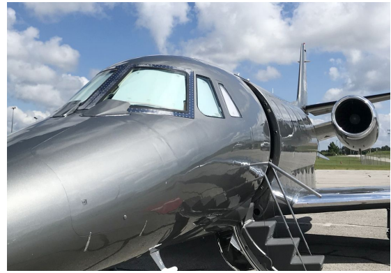
Cessna Citation 560XL Cockpit HeatShields