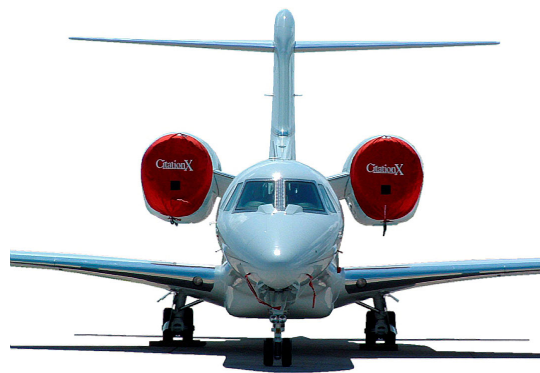
Citation X Intake Covers