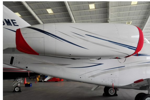
Citation X Intake/Exhaust Cover Set