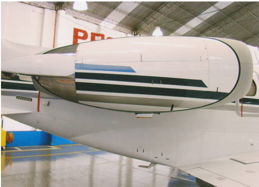
Citation XL Bikini Style Engine Covers