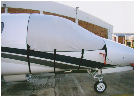
Citation XL Cockpit Cover