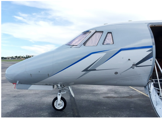
Cessna Citation 650 Cockpit HeataShields