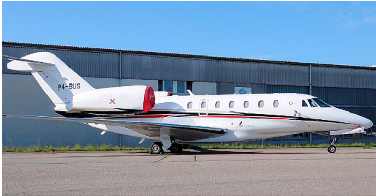
Citation X Intake & Pitot Tube Covers

The Engine Exhaust Plugs are custom fit for your Cessna Citation X (750) exhaust openings, made with heavy-duty vinyl material, and stuffed with a single block of sculpted urethane foam. Each plug has a zipper that allows the foam to be removed and dried if necessary. Exhaust plugs have 'remove before flight' streamers sewn onto the face of the plugs. Most plugs are imprinted with the aircraft registration number in black for an extra charge. Exhaust plugs may be inserted soon after flight when the engine is still warm. Engine Inlet Plugs are commonly referred to as Cowl Plugs, Intake Plugs, Cowl Blocks, Engine Blocks, and Engine Bungs.