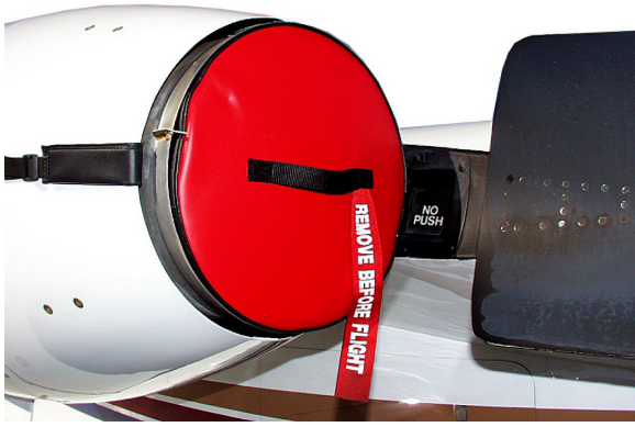
Engine Exhaust Plug