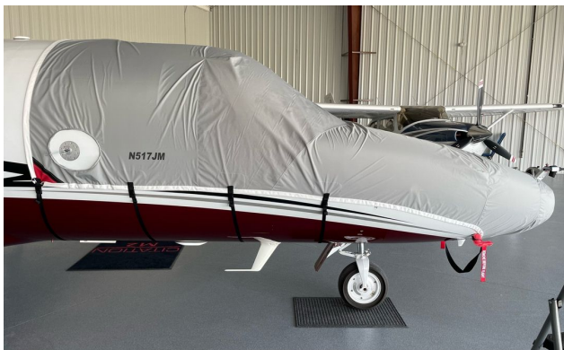
Cessna Citationjet M2 Light Weight Travel Cockpit/Nose Cover

Travel Covers are made with Silver Solution-Dyed Polyester fabric and only lined over the windshield to save weight. The material is lightweight and more compact for easy stowage in the aircraft. The polyester material is water resistant, but only intended for occasional use outside. We also have an ultra lightweight material available for fitted hangar dust covers. For daily outdoor use, the non-travel Sunbrella Cover is the best choice.