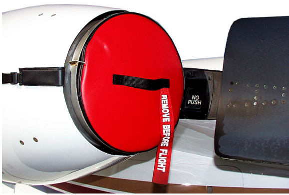
Engine Exhaust Plug