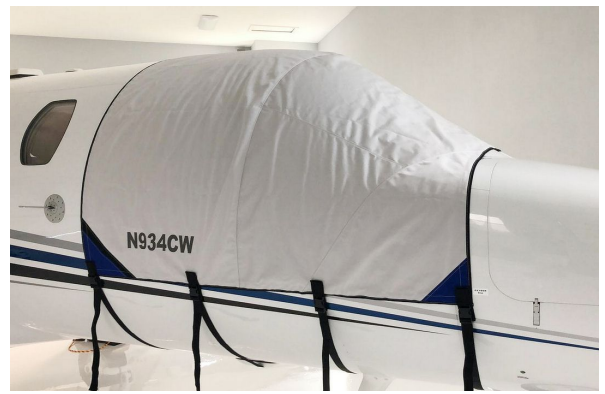
Cessna Citation M2 Cockpit Cover