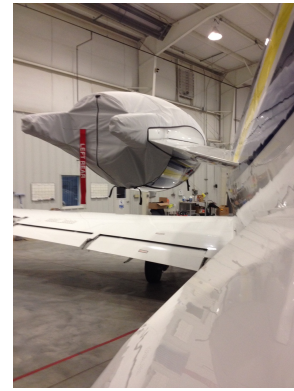
Cessna Citation 560XL Upper Nacelle/Brightwork Covers