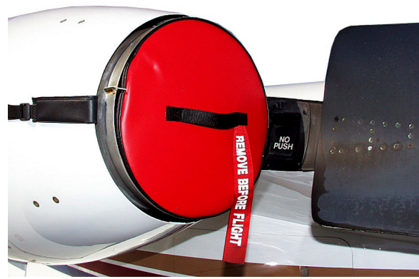
Engine Exhaust Plug