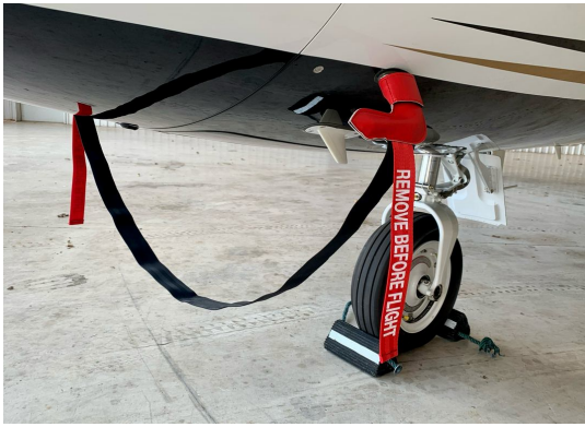
Cessna Citationjet CJ1 Pitot Cover Set