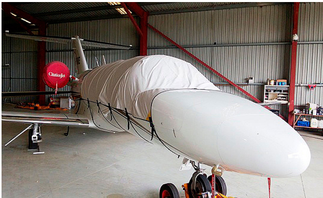
Citation CJ-1 Canopy Cover and Engine Covers

Travel Covers are made with Silver Solution-Dyed Polyester fabric and only lined over the windshield to save weight. The material is lightweight and more compact for easy stowage in the aircraft. The polyester material is water resistant, but only intended for occasional use outside. We also have an ultra lightweight material available for fitted hangar dust covers. For daily outdoor use, the non-travel Sunbrella Cover is the best choice.