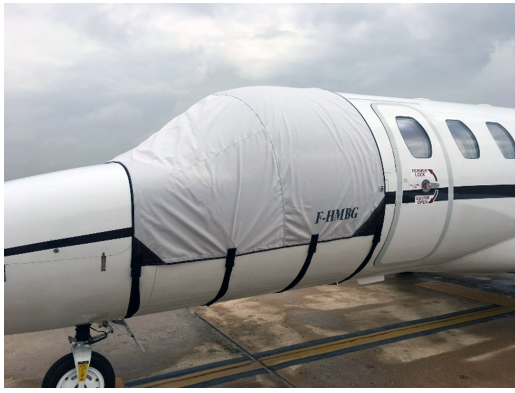
Cessna Citationjet 525A, CJ-2, & CJ2+ Cockpit Cover