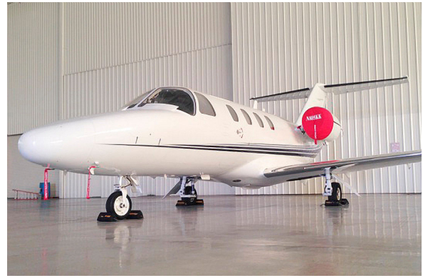
Cessna CJ1 Intake Cover