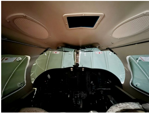
Cessna 525A Cockpit heatshields