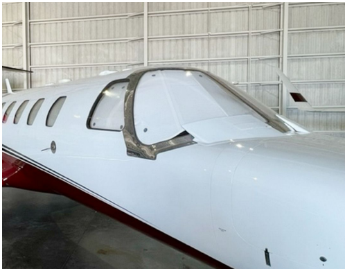
Cessna 525A Cockpit heatshields

Custom-made Heatshield Sunshades are available for almost any window in the jet. Side windows, Skylights, and Emergency Exits are all custom-made. The product is a unique composite of closed-cell foam with a silver mylar finish. The set is easily stored in the included storage sleeve. Some designs may require velcro and suction cups. Our Heatshields are offered white side out since aircraft manufacturers have issued advisories against reflective window inserts due to potential heat damage.