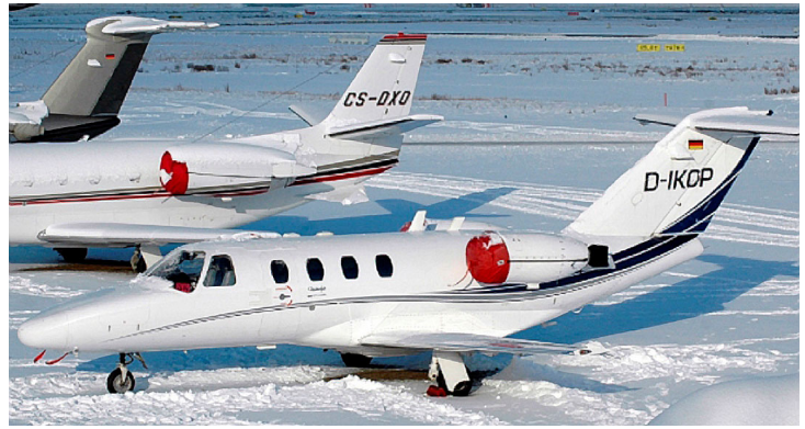
Cessna Citation "Bikini" Type Engine Covers: Extremely Light & Portable