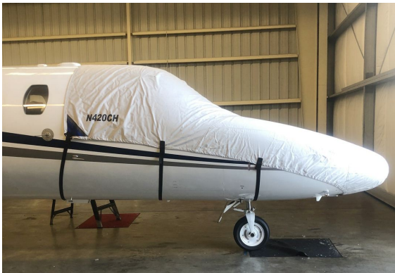
Cessna Citationjet CJ3 Cockpit/Nose Cover

This cover type is made from Silver Acrylic Sunbrella canvas and is 100% lined with a soft and smooth microfiber. Bruce's Custom Covers developed this material combination especially for aircraft protection. The outer material is medium weight and treated for water resistance, UV resistance and anti-static buildup. The inner lining is a very soft and smooth microfiber to prevent scratching. The material is very reflective, and tests show that the cabin interior temperature can be reduced to near-ambient temperature on the hottest of days. It is water, ice and snow repellent, yet breathable to allow moisture to escape from between the cover and the aircraft surface.