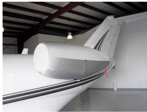
Citation CJ3 Bikini Style Engine Cover Set, full nacelle enclosure