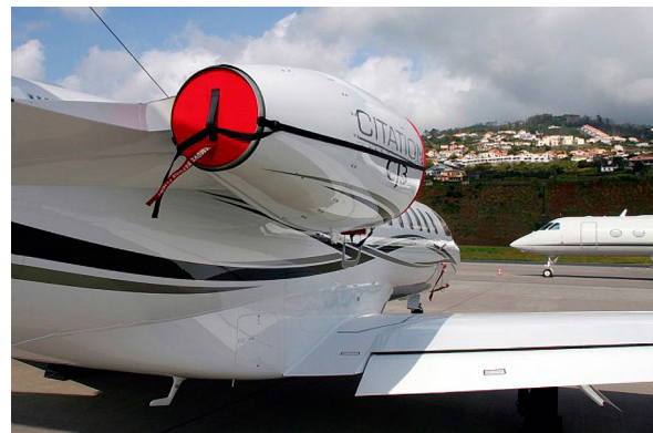
Citation CJ3 Exhaust Plug