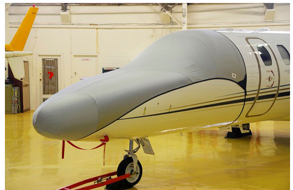
Citationjet CJ3 Cockpit/Nose Travel Cover