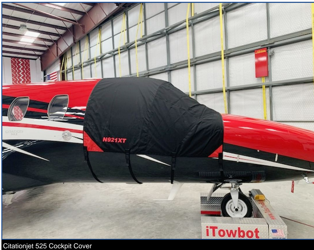
Citationjet 525 Cockpit Cover