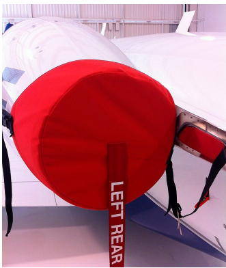
Citation CJ3 Exhaust Cover

The Cessna Citationjet 525B, CJ-3 Intake/Exhaust Plugs are custom fit for the intake and exhaust openings, made with heavy-duty vinyl material, and stuffed with a single block of sculpted urethane foam. Each plug has a zipper that allows the foam to be removed and dried if necessary. Engine plugs have 'remove before flight' streamers sewn onto the face of the plugs. Most plugs are imprinted with the aircraft registration number in black. Engine plugs may be inserted after flight when the engine is still warm. Engine Inlet Plugs are commonly referred to as Cowl Plugs, Intake Plugs, Cowl Blocks, Engine Blocks, and Engine Bungs.