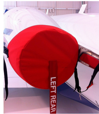
Citation CJ3 Exhaust Cover