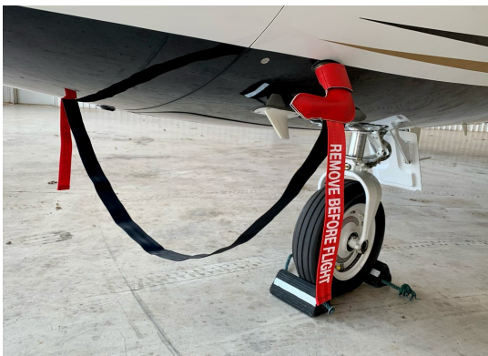
Cessna Citationjet CJ1 Pitot Cover Set

The Engine Inlet Plugs are custom fit for your Cessna Citationjet 525B, CJ-3 intakes, made with heavy-duty vinyl material, and stuffed with a single block of sculpted urethane foam. Each plug has a zipper that allows the foam to be removed and dried if necessary. Engine plugs have 'remove before flight' streamers sewn onto the face of the plugs. Most plugs are imprinted with the aircraft registration number in black for an extra charge. Storage bag NOT included. Engine plugs may be inserted after flight when the engine is still warm. Engine Inlet Plugs are commonly referred to as Cowl Plugs, Intake Plugs, Cowl Blocks, Engine Blocks, and Engine Bungs.