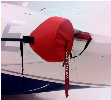
Citation CJ3 Exhaust Cover

The Cessna Citationjet 525B, CJ-3 Intake/Exhaust Plugs are custom fit for the intake and exhaust openings, made with heavy-duty vinyl material, and stuffed with a single block of sculpted urethane foam. Each plug has a zipper that allows the foam to be removed and dried if necessary. Engine plugs have 'remove before flight' streamers sewn onto the face of the plugs. Most plugs are imprinted with the aircraft registration number in black. Engine plugs may be inserted after flight when the engine is still warm. Engine Inlet Plugs are commonly referred to as Cowl Plugs, Intake Plugs, Cowl Blocks, Engine Blocks, and Engine Bungs.