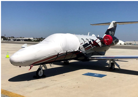
Citationjet CJ1 Cockpit/Nose Cover

This cover type is made from Silver Acrylic Sunbrella canvas and is 100% lined with a soft and smooth microfiber. Bruce's Custom Covers developed this material combination especially for aircraft protection. The outer material is medium weight and treated for water resistance, UV resistance and anti-static buildup. The inner lining is a very soft and smooth microfiber to prevent scratching. The material is very reflective, and tests show that the cabin interior temperature can be reduced to near-ambient temperature on the hottest of days. It is water, ice and snow repellent, yet breathable to allow moisture to escape from between the cover and the aircraft surface.