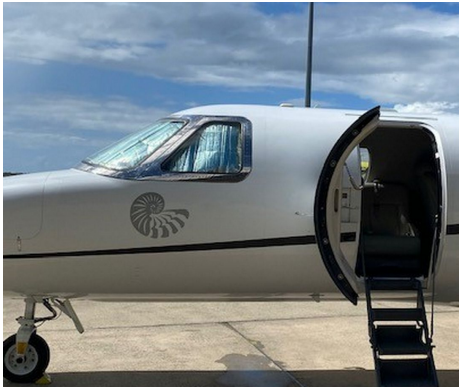
Cessna Citationjet CJ2 Cockpit HeatShields

Cockpit Heatshields are interior sunshades for the aircraft's cockpit. The product is a unique composite of closed-cell foam with a silver mylar finish. The semi-rigid design is stiff enough to stand inside the window framing. The set folds up flat and is easily stored in the included storage sleeve. Some designs may require velcro and suction cups. Our Heatshields for jets are offered white side out because some aircraft manufacturers have issued advisories against reflective window inserts due to potential heat damage. A Heatshield is an excellent short-term remedy for cockpit overheating, but an external fabric cover is more effective for long-term protection.