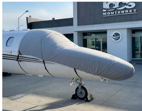
Citation CJ4 Cockpit/Nose Cover and Heat Resistant Pitot Covers set Cessna Citationjet 525B Travel Weight Cockpit/Nose Cover