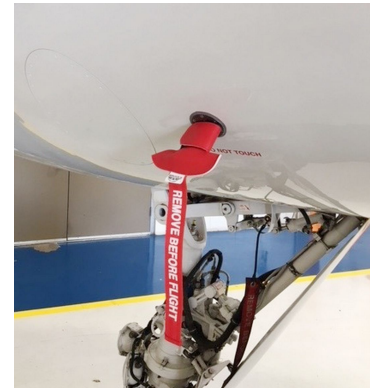
Citation CJ4 Cockpit/Nose Cover and Heat Resistant Pitot Covers set