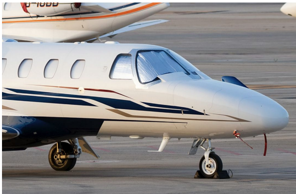
Cessna Citationjet 525, CJ-I, CJ1+, & M2 Cockpit Heatshields

Cockpit Heatshields are interior sunshades for the aircraft's cockpit. The product is a unique composite of closed-cell foam with a silver mylar finish. The semi-rigid design is stiff enough to stand inside the window framing. The set folds up flat and is easily stored in the included storage sleeve. Some designs may require velcro and suction cups. Our Heatshields for jets are offered white side out because some aircraft manufacturers have issued advisories against reflective window inserts due to potential heat damage. A Heatshield is an excellent short-term remedy for cockpit overheating, but an external fabric cover is more effective for long-term protection.