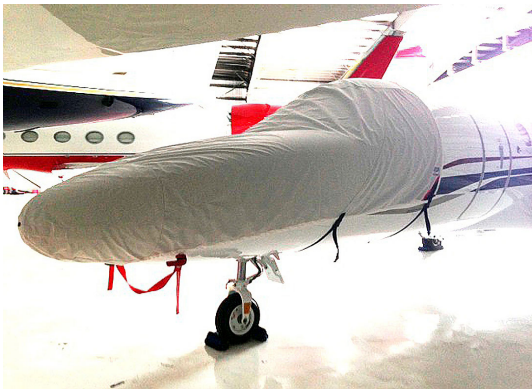
Citation CJ4 Cockpit/Nose Cover and Heat Resistant Pitot Covers set