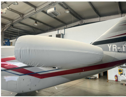
Citationjet 525C, CJ4, Complete Nacelle Cover, light weight Spandex