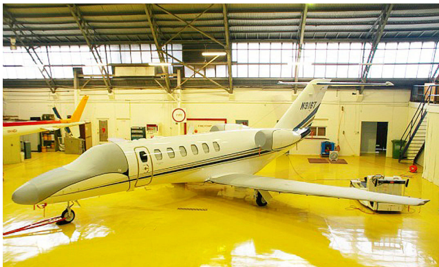
Cessna Citationjet CJ3 Cockpit/Nose, Engine & Wings Travel Covers