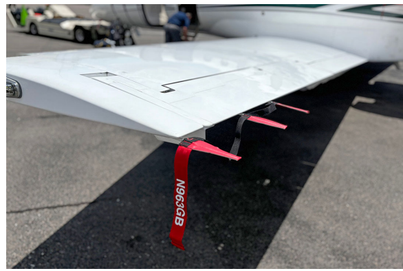
Cessna Citationjet 525C, CJ-4 Static Wick Protectors, 3 Per Wing, 1 On Tailcone Area