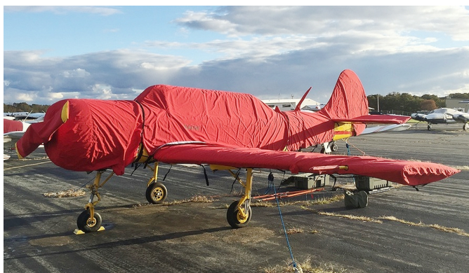
Yak 52 Full Cover Set