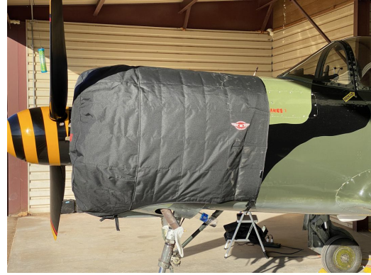
Nanchang CJ6 Insulated Engine Cover