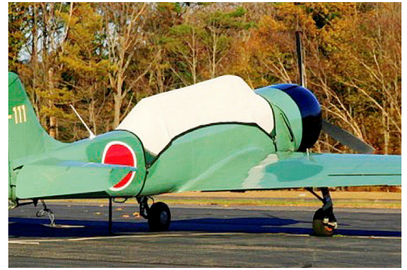
Yak 52 Canopy Cover