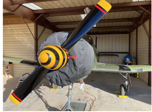
Nanchang CJ6 Insulated Engine Cover