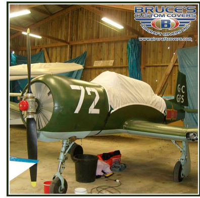
CJ6 Canopy Cover