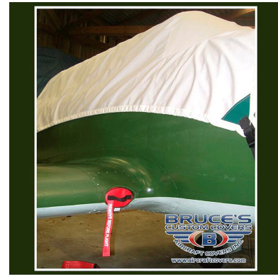
CJ6 Canopy Cover & Leading Edge Inlet Plug