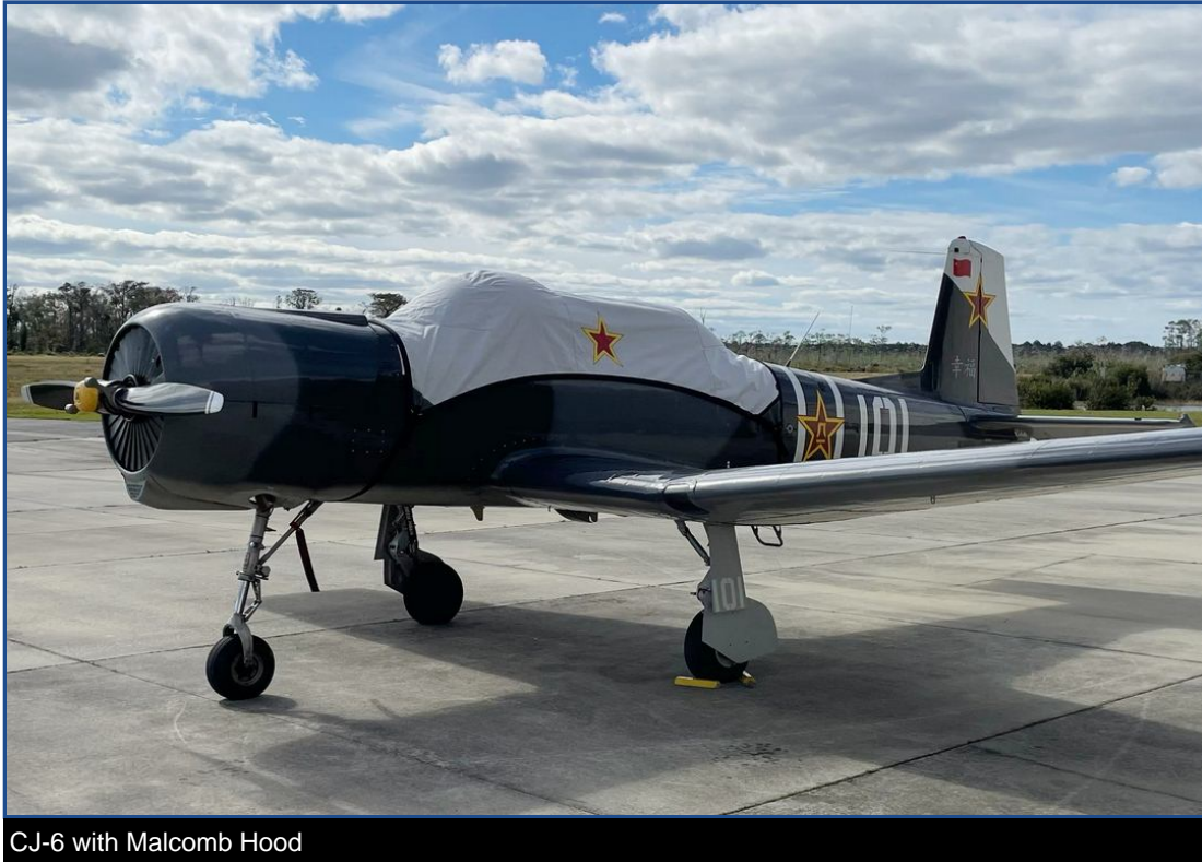
CJ-6 with Malcomb Hood