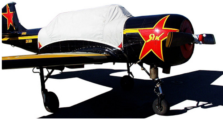
Yak 52 Canopy Cover