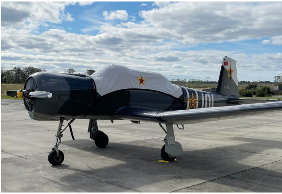
CJ-6 with Malcomb Hood