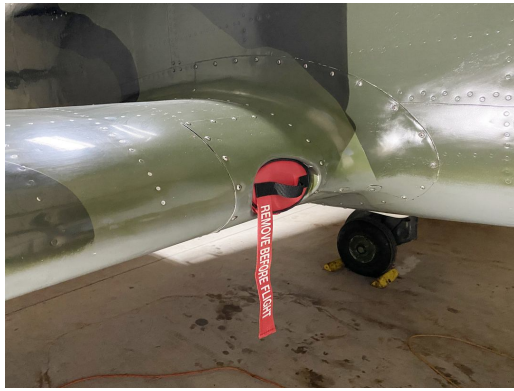
Nanchang CJ-6A Leading Edge Plug