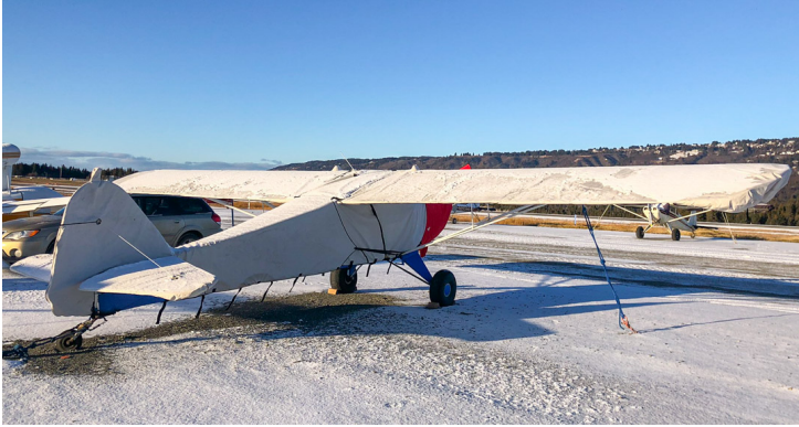
Taylorcraft Aviation Corp F19 Wing Covers

WINTER USE MATERIAL - Made with Solution-Dyed Polyester fabric, this option is intended for seasonal use to aid in deicing, rain mitigation, or for occasional travel. The material is lighter and more compact, but more susceptible to UV damage and may have a shorter useful life if used continuously outside than the all-year use material.