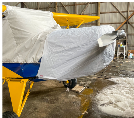
Fleet 80 Canuck Engine Cover, test fit cover