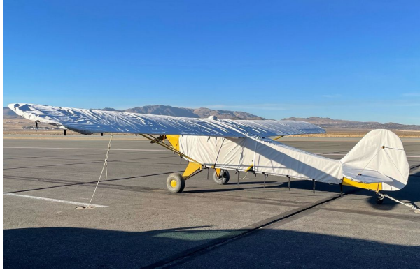
Taylorcraft BC-12D Extended Canopy, Wing & Empennage Covers

This cover type is made from Silver Acrylic Sunbrella canvas and is 100% lined with a soft and smooth microfiber. Bruce's Custom Covers developed this material combination especially for aircraft protection. The outer material is medium weight and treated for water resistance, UV resistance and anti-static buildup. The inner lining is a very soft and smooth microfiber to prevent scratching. The material is very reflective, and tests show that the cabin interior temperature can be reduced to near-ambient temperature on the hottest of days. It is water, ice and snow repellent, yet breathable to allow moisture to escape from between the cover and the aircraft surface.