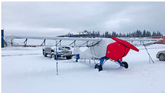
Taylorcraft Aviation Corp F19 Insulated Engine Cover

This cover type is made from Silver Acrylic Sunbrella canvas and is 100% lined with a soft and smooth microfiber. Bruce's Custom Covers developed this material combination especially for aircraft protection. The outer material is medium weight and treated for water resistance, UV resistance and anti-static buildup. The inner lining is a very soft and smooth microfiber to prevent scratching. The material is very reflective, and tests show that the cabin interior temperature can be reduced to near-ambient temperature on the hottest of days. It is water, ice and snow repellent, yet breathable to allow moisture to escape from between the cover and the aircraft surface.