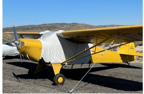
Taylorcraft BC-12D Extended Canopy Cover