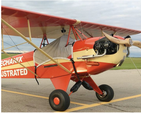
Corben Baby Ace Cockpit Cover