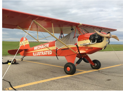
Corben Baby Ace Cockpit Cover