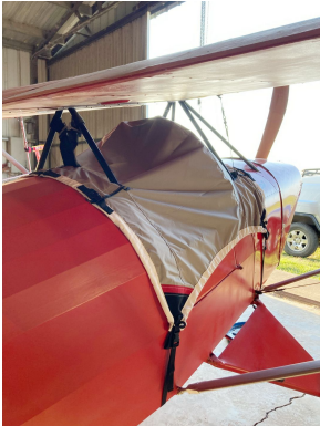
Corben Junior Ace Travel Weight Canopy Cover

This cover type is made from Silver Acrylic Sunbrella canvas and is 100% lined with a soft and smooth microfiber. Bruce's Custom Covers developed this material combination especially for aircraft protection. The outer material is medium weight and treated for water resistance, UV resistance and anti-static buildup. The inner lining is a very soft and smooth microfiber to prevent scratching. The material is very reflective, and tests show that the cabin interior temperature can be reduced to near-ambient temperature on the hottest of days. It is water, ice and snow repellent, yet breathable to allow moisture to escape from between the cover and the aircraft surface.