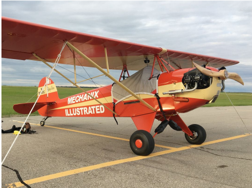
Corben Baby Ace Cockpit Cover