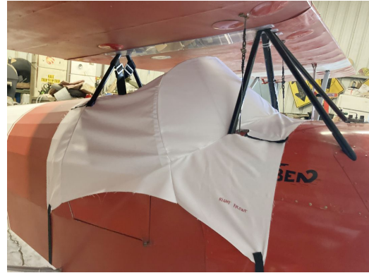
Corben Junior Ace Cockpit Cover, test fit cover