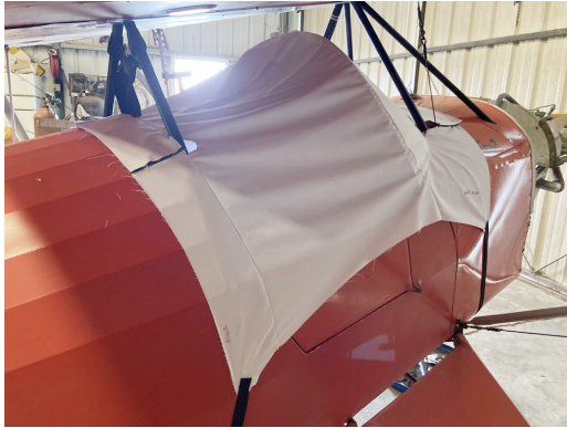
Corben Junior Ace Cockpit Cover, test fit cover

This cover type is made from Silver Acrylic Sunbrella canvas and is 100% lined with a soft and smooth microfiber. Bruce's Custom Covers developed this material combination especially for aircraft protection. The outer material is medium weight and treated for water resistance, UV resistance and anti-static buildup. The inner lining is a very soft and smooth microfiber to prevent scratching. The material is very reflective, and tests show that the cabin interior temperature can be reduced to near-ambient temperature on the hottest of days. It is water, ice and snow repellent, yet breathable to allow moisture to escape from between the cover and the aircraft surface.