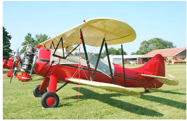
Waco YMF Canopy Cover