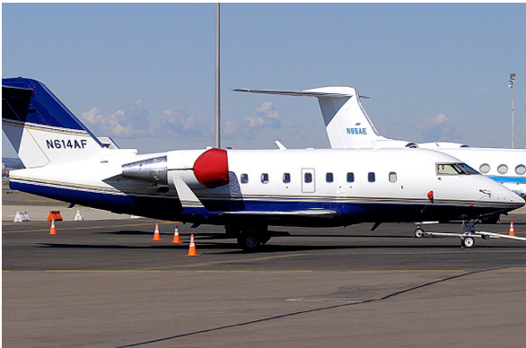
Challenger 604 Intake Covers, standard design