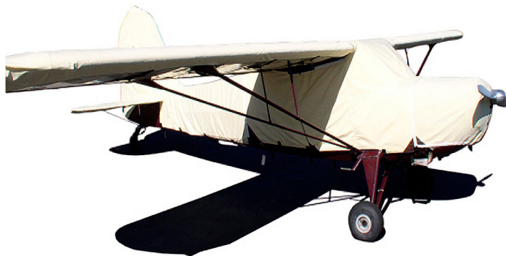
Skyranger Full Cover Set

This cover type is made from Silver Acrylic Sunbrella canvas and is 100% lined with a soft and smooth microfiber. Bruce's Custom Covers developed this material combination especially for aircraft protection. The outer material is medium weight and treated for water resistance, UV resistance and anti-static buildup. The inner lining is a very soft and smooth microfiber to prevent scratching. The material is very reflective, and tests show that the cabin interior temperature can be reduced to near-ambient temperature on the hottest of days. It is water, ice and snow repellent, yet breathable to allow moisture to escape from between the cover and the aircraft surface.