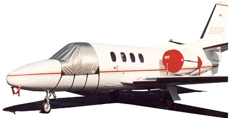
Cessna Citation I Windshield, Pitot and Engine Covers