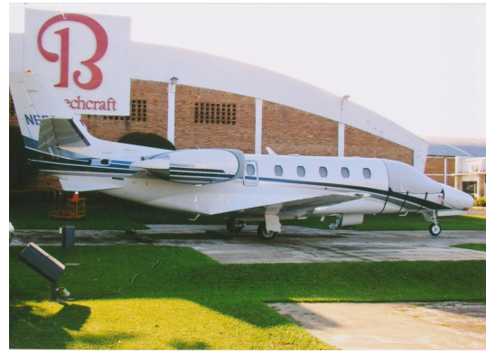
Citation XL Cockpit Cover & Bikini Type Engine Cover