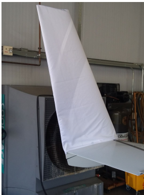
Velocity Vertical Stabilizer Covers, test fit cover

WINTER USE MATERIAL - Made with Solution-Dyed Polyester fabric, this option is intended for seasonal use to aid in deicing, rain mitigation, or for occasional travel. The material is lighter and more compact, but more susceptible to UV damage and may have a shorter useful life if used continuously outside than the all-year use material.