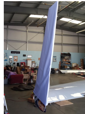
Velocity Vertical Stabilizer Covers, test fit cover