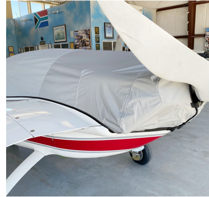
Cozy Mk IV Canopy/Nose/Engine Cover, travel weight design