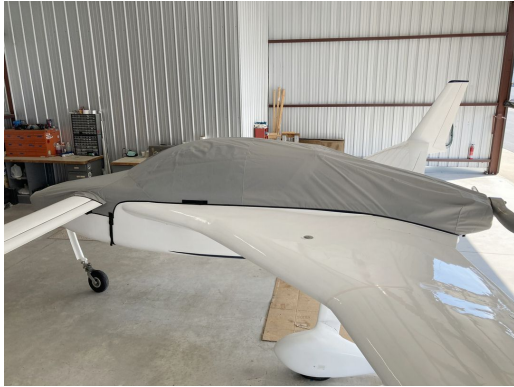
COZY Mk IV Lightweight Travel Canopy/Nose/Engine Cover

Travel Covers are made with Silver Solution-Dyed Polyester fabric and only lined over the windshield to save weight. The material is lightweight and more compact for easy stowage in the aircraft. The polyester material is water resistant, but only intended for occasional use outside. We also have an ultra lightweight material available for fitted hangar dust covers. For daily outdoor use, the non-travel Sunbrella Cover is the best choice.