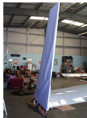
Velocity Vertical Stabilizer Covers, test fit cover