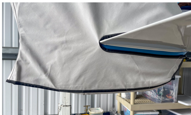
Cozy All Models Vertical Stabilizer Covers, All Year Use

WINTER USE MATERIAL - Made with Solution-Dyed Polyester fabric, this option is intended for seasonal use to aid in deicing, rain mitigation, or for occasional travel. The material is lighter and more compact, but more susceptible to UV damage and may have a shorter useful life if used continuously outside than the all-year use material.