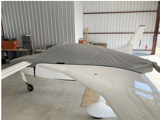
COZY Mk IV Lightweight Travel Canopy/Nose/Engine Cover