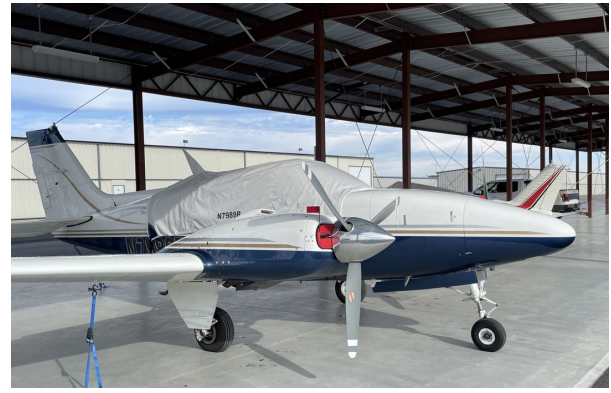
Beech Baron D55 Canopy Cover, Engine Plugs