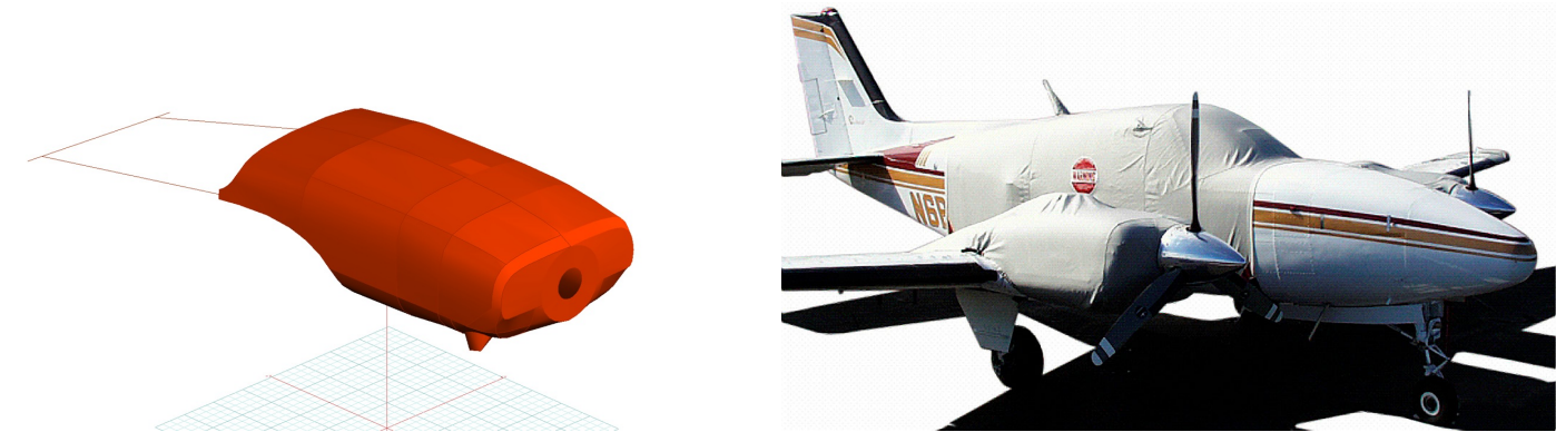
Beech Baron Insulated Engine Cover (3D Model) Standard Canopy Cover & Engine Plugs. Extended Canopy Cover & Engine Cover

The material is very reflective, and tests show that the cabin interior temperature can be reduced to near-ambient temperature on the hottest of days. It is water, ice and snow repellent, yet breathable to allow moisture to escape from between the cover and the aircraft surface.