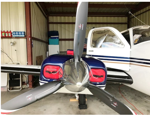
Beech Baron 58 Engine Inlet Plugs & Cowl Top Plugs