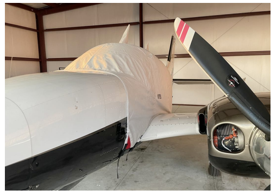
Beech Baron 58TC Extended Canopy Cover