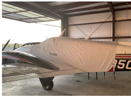
Beech Baron 58TC Extended Canopy Cover