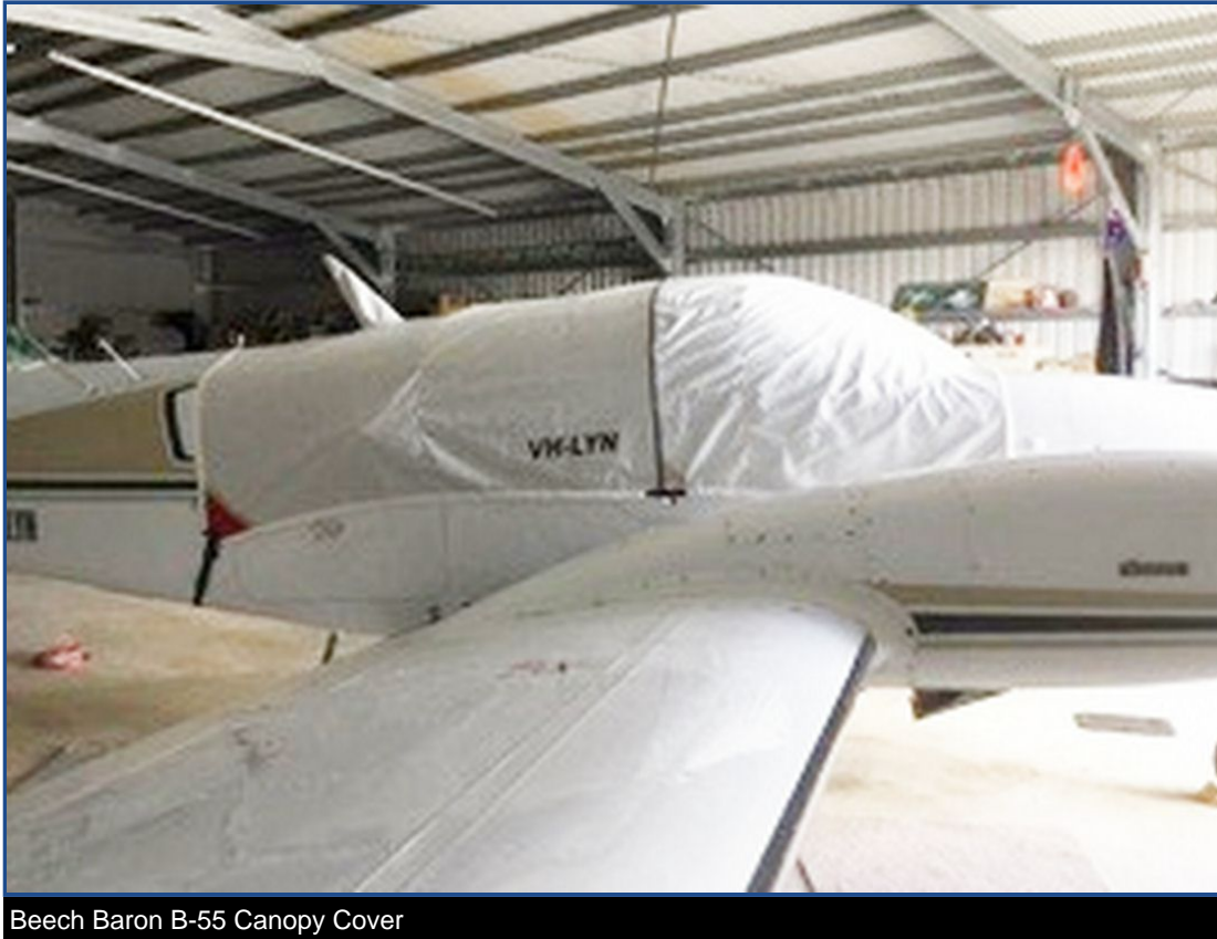
Beech Baron B-55 Canopy Cover