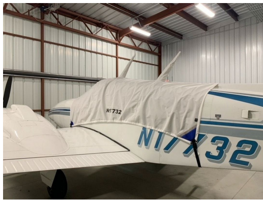
Beech E-55 Canopy Cover