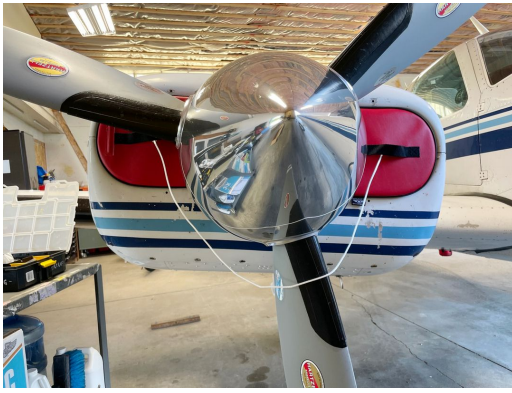
Beech Baron B-55 Engine Plugs