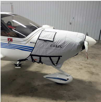
Diamond DA-20-C1 Insulated Engine Cover