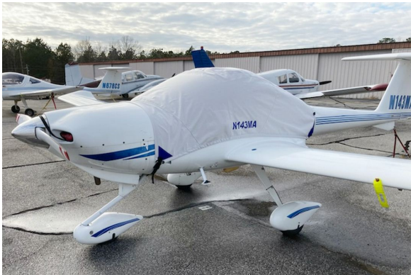
Diamond DA20-C1 Canopy Cover

This cover type is made from Silver Acrylic Sunbrella canvas and is 100% lined with a soft and smooth microfiber. Bruce's Custom Covers developed this material combination especially for aircraft protection. The outer material is medium weight and treated for water resistance, UV resistance and anti-static buildup. The inner lining is a very soft and smooth microfiber to prevent scratching. The material is very reflective, and tests show that the cabin interior temperature can be reduced to near-ambient temperature on the hottest of days. It is water, ice and snow repellent, yet breathable to allow moisture to escape from between the cover and the aircraft surface.