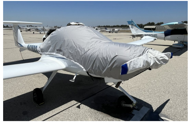
Diamond DA-20 Canopy/Engine Cover (Travel Weight), Prop Cover