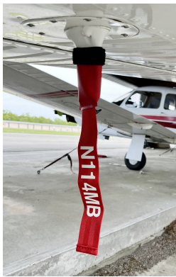
Blade-type Pitot Cover

Engine Inlet Plugs are custom fit for your Diamond DA-20, Katana, Eclipse intakes, made with heavy-duty vinyl material, and stuffed with a single block of sculpted urethane foam. Each plug has a zipper that allows the foam to be removed and dried if necessary. Engine plugs have warning flags that are visible from the cockpit or 'remove before flight' streamers sewn onto the face of the plugs. Most plugs are imprinted with the aircraft registration number in black for an extra charge. Storage bag NOT included. Engine plugs may be inserted after flight when the engine is still warm. Engine Inlet Plugs are commonly referred to as Cowl Plugs, Intake Plugs, Cowl Blocks, Engine Blocks, and Engine Bungs.