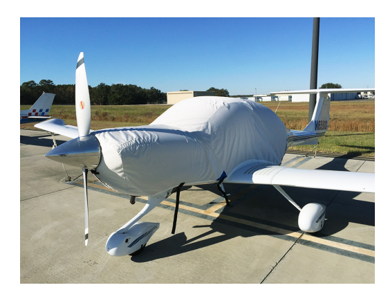
Diamond DA-40 Extended Canopy/Engine Cover