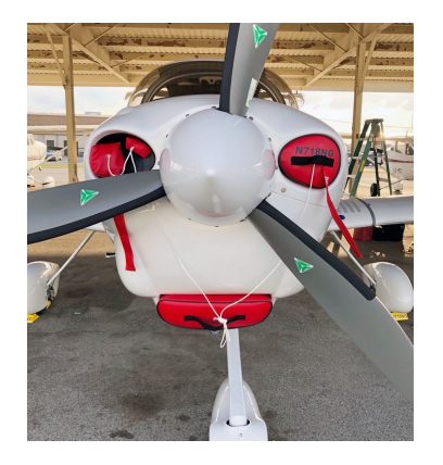
Diamond DA-40 Engine Plugs, Ng Model

Engine Inlet Plugs are custom fit for your Diamond DA-40 intakes, made with heavy-duty vinyl material, and stuffed with a single block of sculpted urethane foam. Each plug has a zipper that allows the foam to be removed and dried if necessary. Engine plugs have warning flags that are visible from the cockpit or 'remove before flight' streamers sewn onto the face of the plugs. Most plugs are imprinted with the aircraft registration number in black for an extra charge. Storage bag NOT included. Engine plugs may be inserted after flight when the engine is still warm. Engine Inlet Plugs are commonly referred to as Cowl Plugs, Intake Plugs, Cowl Blocks, Engine Blocks, and Engine Bungs.