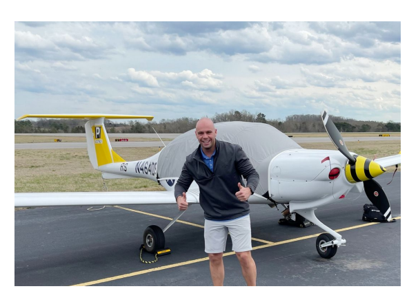
Diamond DA-40 Light Weight Travel Cover

Diamond DA-40 Travel Cover, Light Weight Travel Canopy Cover