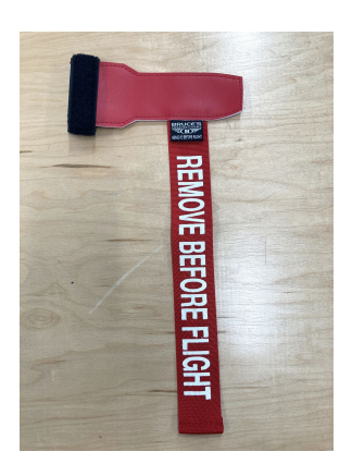
Pitot Tube Cover