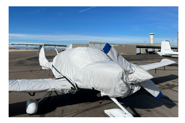
Diamond DA-40 Full Cover Set

This cover type is made from Silver Acrylic Sunbrella canvas and is 100% lined with a soft and smooth microfiber. Bruce's Custom Covers developed this material combination especially for aircraft protection. The outer material is medium weight and treated for water resistance, UV resistance and anti-static buildup. The inner lining is a very soft and smooth microfiber to prevent scratching. The material is very reflective, and tests show that the cabin interior temperature can be reduced to near-ambient temperature on the hottest of days. It is water, ice and snow repellent, yet breathable to allow moisture to escape from between the cover and the aircraft surface.