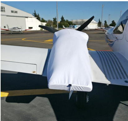
DA42 MPP Guardian (DA42-NG) Engine Cover, test fit cover

The material is very reflective, and tests show that the cabin interior temperature can be reduced to near-ambient temperature on the hottest of days. It is water, ice and snow repellent, yet breathable to allow moisture to escape from between the cover and the aircraft surface.