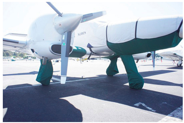
Twinstar Landing Gear & Gearwell Covers