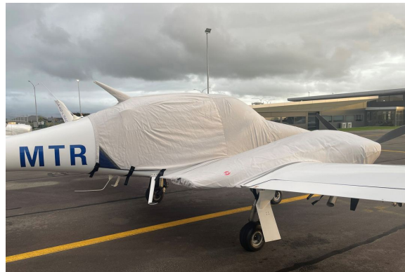
Diamond DA-42 Extended Canopy/Nose & Engine Covers