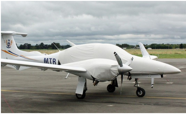
DA-42 (Lycoming Engine) Extended Canopy/Nose Cover, Engine Covers