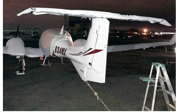
Diamond DA-42 Twin Star Wing & Engine Covers