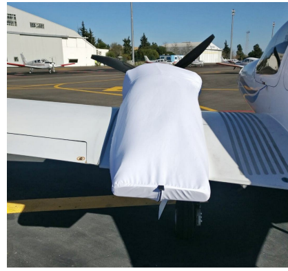
DA42 MPP Guardian (DA42-NG) Engine Cover, test fit cover