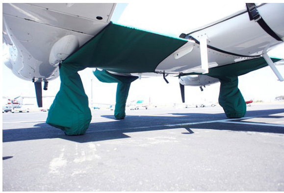
Twinstar Landing Gear & Gearwell Covers