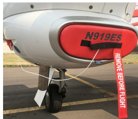
Diamond Da-42 Engine Inlet Plugs Set of 4