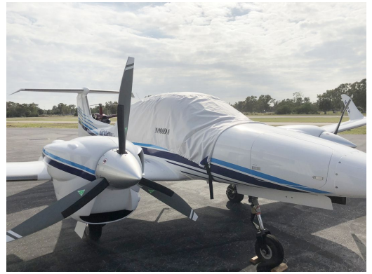
Diamond DA-42 Twin Star Canopy Cover