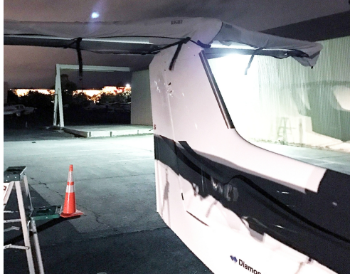
Diamond DA-42 Twin Star Wing & Engine Covers

WINTER USE MATERIAL - Made with Solution-Dyed Polyester fabric, this option is intended for seasonal use to aid in deicing, rain mitigation, or for occasional travel. The material is lighter and more compact, but more susceptible to UV damage and may have a shorter useful life if used continuously outside than the all-year use material.