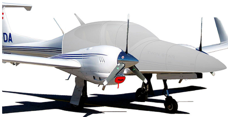
Twinstar Extended Canopy/Nose Cover & Engine Plugs (Illustration)

Engine Inlet Plugs are custom fit for your Diamond DA-42 Twin Star intakes, made with heavy-duty vinyl material, and stuffed with a single block of sculpted urethane foam. Each plug has a zipper that allows the foam to be removed and dried if necessary. Engine plugs have warning flags that are visible from the cockpit or 'remove before flight' streamers sewn onto the face of the plugs. Most plugs are imprinted with the aircraft registration number in black for an extra charge. Storage bag NOT included. Engine plugs may be inserted after flight when the engine is still warm. Engine Inlet Plugs are commonly referred to as Cowl Plugs, Intake Plugs, Cowl Blocks, Engine Blocks, and Engine Bungs.