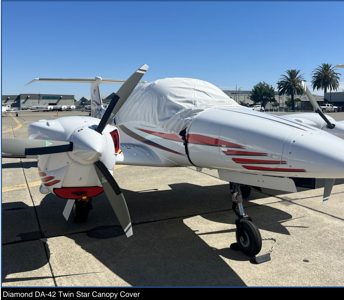
Diamond DA-42 Twin Star Canopy Cover