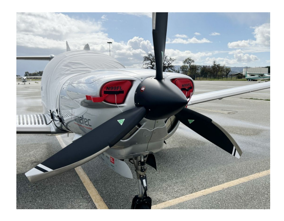
Diamond DA-50 Engine Plugs

Engine Inlet Plugs are custom fit for your Diamond DA-50 Superstar intakes, made with heavy-duty vinyl material, and stuffed with a single block of sculpted urethane foam. Each plug has a zipper that allows the foam to be removed and dried if necessary. Engine plugs have warning flags that are visible from the cockpit or 'remove before flight' streamers sewn onto the face of the plugs. Most plugs are imprinted with the aircraft registration number in black for an extra charge. Storage bag NOT included. Engine plugs may be inserted after flight when the engine is still warm. Engine Inlet Plugs are commonly referred to as Cowl Plugs, Intake Plugs, Cowl Blocks, Engine Blocks, and Engine Bungs.