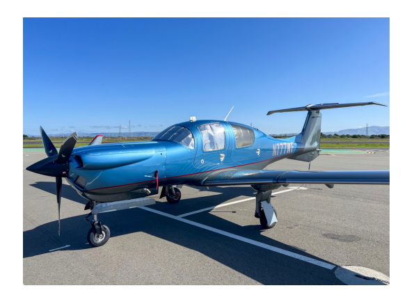
Diamond DA-50 HeatShield Set

Cabin Heatshields are interior sunshades for the aircraft's passenger cabin area. The product is a unique composite of closed-cell foam with a silver mylar finish. The semi-rigid design is stiff enough to stand inside the window framing. The set folds up flat and is easily stored in the included storage sleeve. Some designs may require velcro and suction cups. A Heatshield is an excellent short-term remedy for cockpit overheating, but an external fabric cover is more effective for long-term protection.