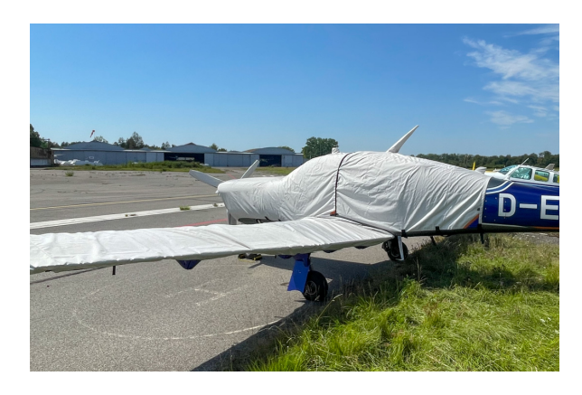
Diamond DA-50 Extended Canopy/Engine Cover, Wing Covers