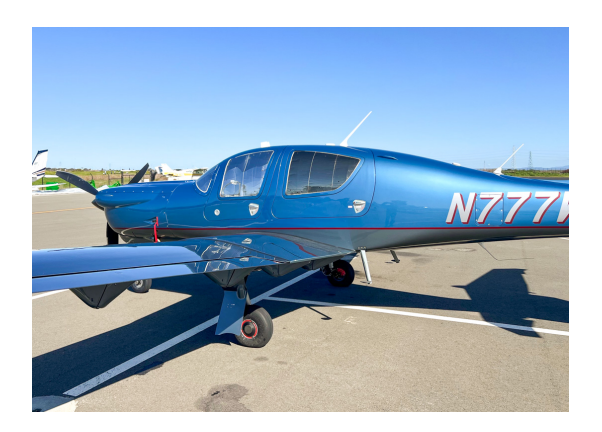
Diamond DA-50 HeatShield Set