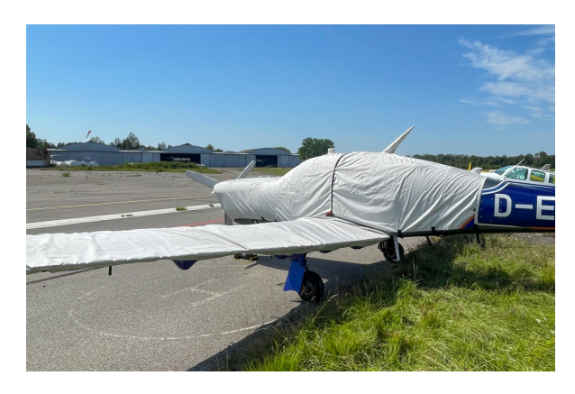
Diamond DA-50 Extended Canopy/Engine Cover, Wing Covers

WINTER USE MATERIAL - Made with Solution-Dyed Polyester fabric, this option is intended for seasonal use to aid in deicing, rain mitigation, or for occasional travel. The material is lighter and more compact, but more susceptible to UV damage and may have a shorter useful life if used continuously outside than the all-year use material.