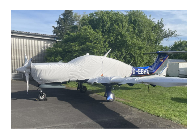
Diamond DA-50 Extended Canopy/Engine, Prop & Wing Covers (test fit)

This cover type is made from Silver Acrylic Sunbrella canvas and is 100% lined with a soft and smooth microfiber. Bruce's Custom Covers developed this material combination especially for aircraft protection. The outer material is medium weight and treated for water resistance, UV resistance and anti-static buildup. The inner lining is a very soft and smooth microfiber to prevent scratching. The material is very reflective, and tests show that the cabin interior temperature can be reduced to near-ambient temperature on the hottest of days. It is water, ice and snow repellent, yet breathable to allow moisture to escape from between the cover and the aircraft surface.