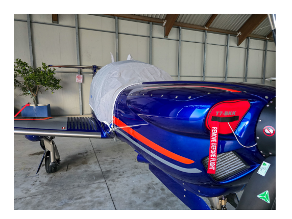
Diamond DA-50 Canopy Cover, Engine Plugs