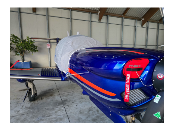
Diamond DA-50 Canopy Cover, Engine Plugs