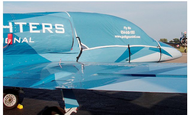
L-39 Canopy Cover & Plugs