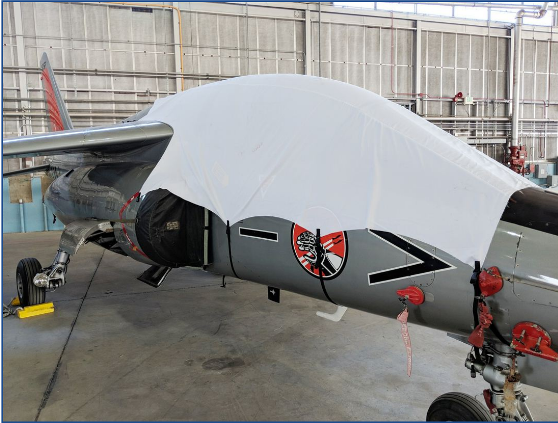
Dornier Alpha Jet Canopy Cover, test fit cover