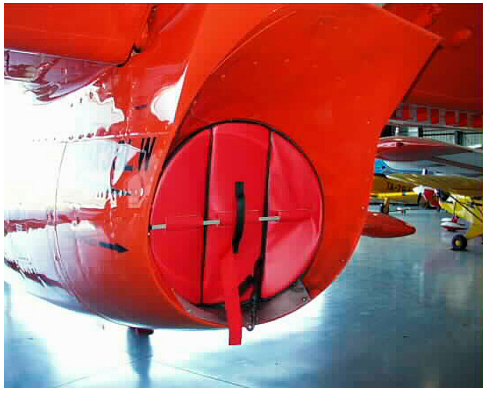
Exhaust Plug, folding type