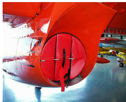
Exhaust Plug, folding type