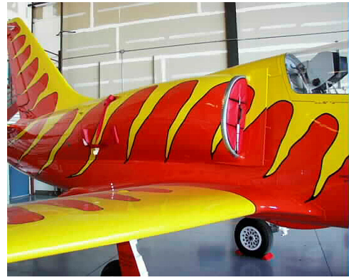
Inlet Plug, folding type