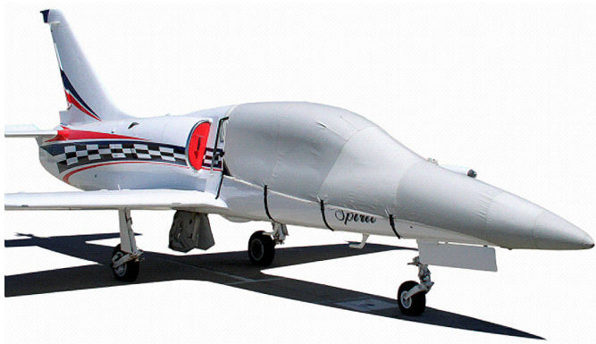
L39 Canopy/Nose Cover & Intake Plugs

This cover type is made from Silver Acrylic Sunbrella canvas and is 100% lined with a soft and smooth microfiber. Bruce's Custom Covers developed this material combination especially for aircraft protection. The outer material is medium weight and treated for water resistance, UV resistance and anti-static buildup. The inner lining is a very soft and smooth microfiber to prevent scratching. The material is very reflective, and tests show that the cabin interior temperature can be reduced to near-ambient temperature on the hottest of days. It is water, ice and snow repellent, yet breathable to allow moisture to escape from between the cover and the aircraft surface.