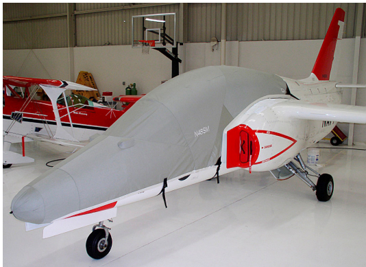
S-211 Canopy/Nose Cover & Engine Plugs

This cover type is made from Silver Acrylic Sunbrella canvas and is 100% lined with a soft and smooth microfiber. Bruce's Custom Covers developed this material combination especially for aircraft protection. The outer material is medium weight and treated for water resistance, UV resistance and anti-static buildup. The inner lining is a very soft and smooth microfiber to prevent scratching. The material is very reflective, and tests show that the cabin interior temperature can be reduced to near-ambient temperature on the hottest of days. It is water, ice and snow repellent, yet breathable to allow moisture to escape from between the cover and the aircraft surface.