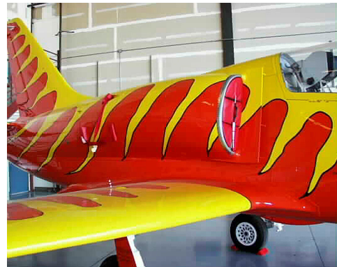
Inlet Plug, folding type