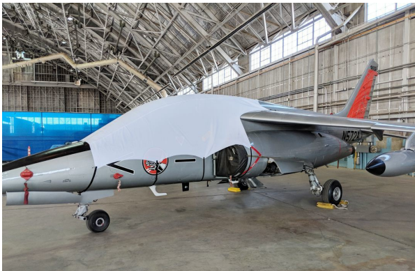
Dornier Alpha Jet Canopy Cover, test fit cover