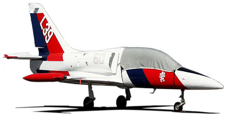
Canopy Cover for Aero L-39 Albatros