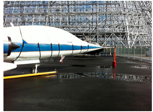
F-104 Tandem Canopy Cover