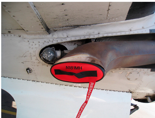
Beech 18 Exhaust Plugs

Engine Inlet Plugs are custom fit for your Douglas DC-3 intakes, made with heavy-duty vinyl material, and stuffed with a single block of sculpted urethane foam. Each plug has a zipper that allows the foam to be removed and dried if necessary. Engine plugs have warning flags that are visible from the cockpit or 'remove before flight' streamers sewn onto the face of the plugs. Most plugs are imprinted with the aircraft registration number in black for an extra charge. Storage bag NOT included. Engine plugs may be inserted after flight when the engine is still warm. Engine Inlet Plugs are commonly referred to as Cowl Plugs, Intake Plugs, Cowl Blocks, Engine Blocks, and Engine Bungs.