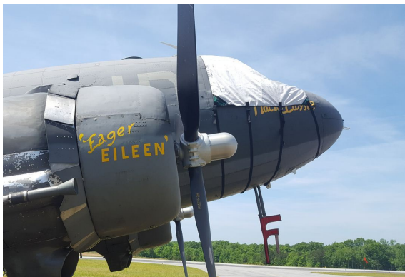
Douglas DC-3 Cockpit Cover