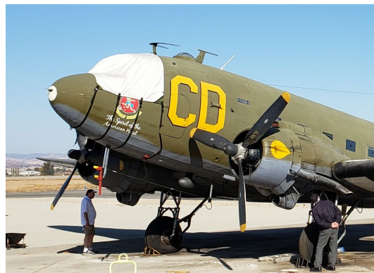
Douglas DC-3 Cockpit Cover