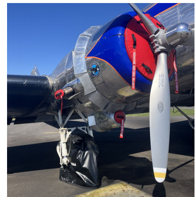
DC-3 Engine Plugs, Tire Covers