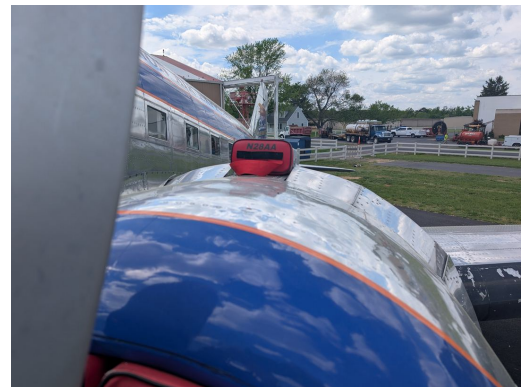
Douglas DC-3 Engine Plugs