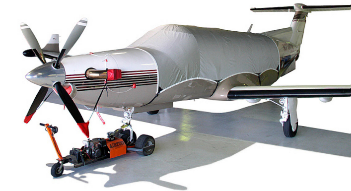
PC-12 Canopy Cover, Engine Plugs, Prop Tie/Exhaust Covers