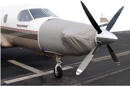
Pilatus PC-12 Engine Cover

This cover type is made from Silver Acrylic Sunbrella canvas and is 100% lined with a soft and smooth microfiber. Bruce's Custom Covers developed this material combination especially for aircraft protection. The outer material is medium weight and treated for water resistance, UV resistance and anti-static buildup. The inner lining is a very soft and smooth microfiber to prevent scratching. The material is very reflective, and tests show that the cabin interior temperature can be reduced to near-ambient temperature on the hottest of days. It is water, ice and snow repellent, yet breathable to allow moisture to escape from between the cover and the aircraft surface.