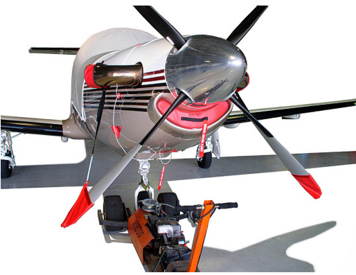
Pilatus PC-12 LARGE ENGINE INLET PLUG, SMALL PLUGS SET, Prop Tie/Exhaust Covers