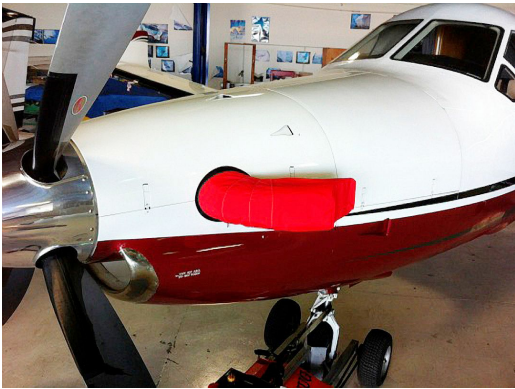
Pilatus PC-12 Exhaust Cover, Fully Enclosed, for protection against corrosion.

This cover type is made from Silver Acrylic Sunbrella canvas and is 100% lined with a soft and smooth microfiber. Bruce's Custom Covers developed this material combination especially for aircraft protection. The outer material is medium weight and treated for water resistance, UV resistance and anti-static buildup. The inner lining is a very soft and smooth microfiber to prevent scratching. The material is very reflective, and tests show that the cabin interior temperature can be reduced to near-ambient temperature on the hottest of days. It is water, ice and snow repellent, yet breathable to allow moisture to escape from between the cover and the aircraft surface.