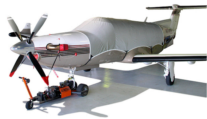
PC-12 Canopy Cover, Engine Plugs, Prop Tie/Exhaust Covers

Engine Inlet Plugs are custom fit for your Beech Denali 220 intakes, made with heavy-duty vinyl material, and stuffed with a single block of sculpted urethane foam. Each plug has a zipper that allows the foam to be removed and dried if necessary. Engine plugs have warning flags that are visible from the cockpit or 'remove before flight' streamers sewn onto the face of the plugs. Most plugs are imprinted with the aircraft registration number in black for an extra charge. Storage bag NOT included. Engine plugs may be inserted after flight when the engine is still warm. Engine Inlet Plugs are commonly referred to as Cowl Plugs, Intake Plugs, Cowl Blocks, Engine Blocks, and Engine Bungs.