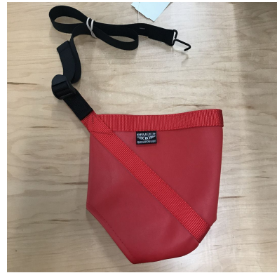
Prop Tie-Down, Various Models (secures with a hook to engine nacelle)