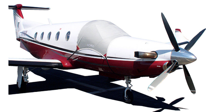
PC-12 Windshield Cover

This cover type is made from Silver Acrylic Sunbrella canvas and is 100% lined with a soft and smooth microfiber. Bruce's Custom Covers developed this material combination especially for aircraft protection. The outer material is medium weight and treated for water resistance, UV resistance and anti-static buildup. The inner lining is a very soft and smooth microfiber to prevent scratching. The material is very reflective, and tests show that the cabin interior temperature can be reduced to near-ambient temperature on the hottest of days. It is water, ice and snow repellent, yet breathable to allow moisture to escape from between the cover and the aircraft surface.