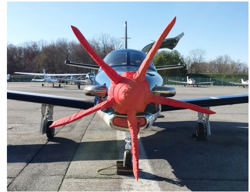
Main Intake Plug and Prop-Tie/Exhaust Covers. (Sold Separately)