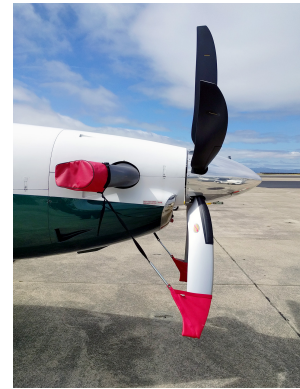
Pilatus PC-12 Prop Tie-Down/Exhaust Cover Set, 5 Blade