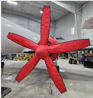
Fairchild Metro 5 Blade Insulated Insulated Prop Covers