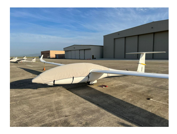
DG Flugzeugbau DG 1000S Canopy/Nose Cover w/turtledeck ext