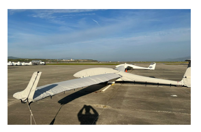
DG Flugzeugbau DG 1000S Complete Cover Set