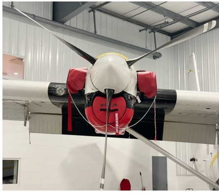
DeHavilland DH-6 Intake Plugs, Exhaust Covers