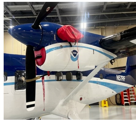
DeHavilland Twin Otter DHC6 Intake Plug, Exhaust Covers