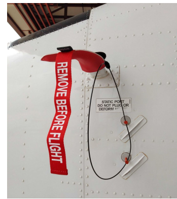
DeHavilland Twin Otter DHC6 Pitot Covers with Static Port Plugs