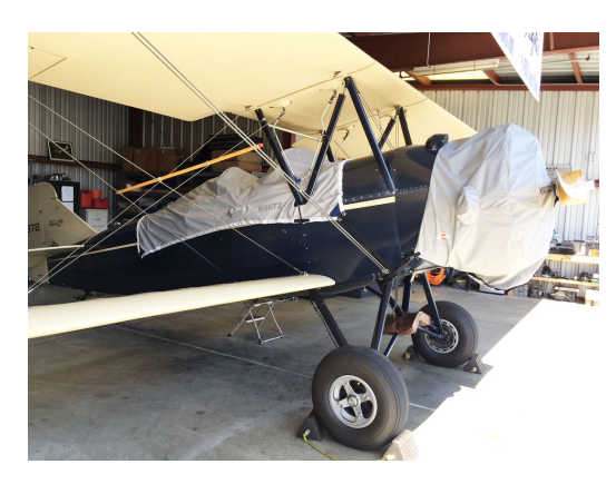
Travel Air 4000 Canopy and Engine Covers, light weight travel Travel Air 4000 Canopy and Engine Covers, light weight travel type