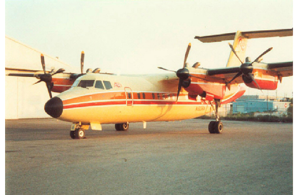
Covers & Plugs for the Dash 7