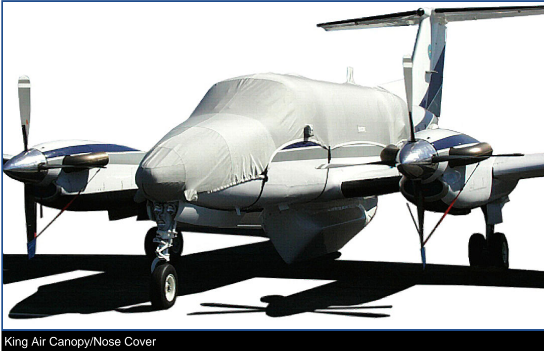
King Air Canopy/Nose Cover