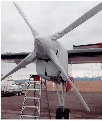
Dash 8 Insulated Engine & Prop Covers