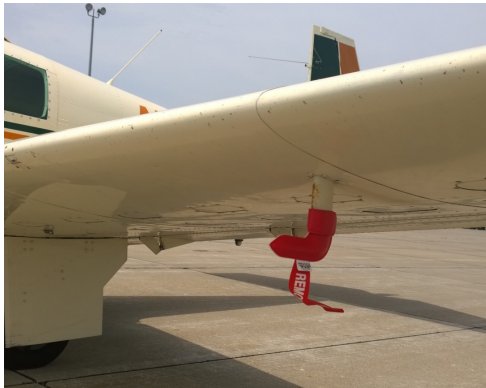
Mooney Pitot Cover