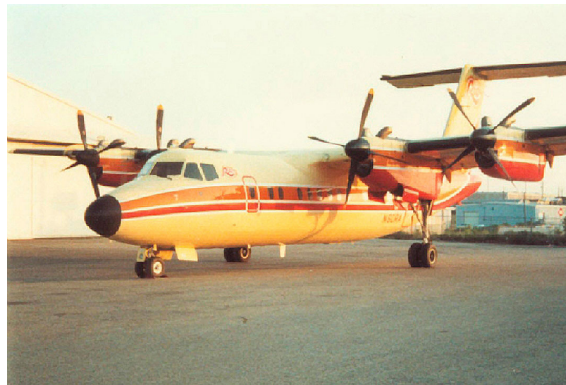
Covers & Plugs for the Dash 7