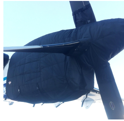
ATR-72-202 Insulated Engine & Prop Hub Covers