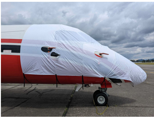
DeHavilland Dash 8, Q400 Cockpit/Nose Cover, test fit cover