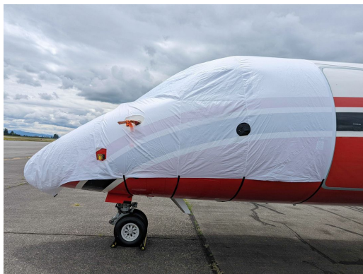
DeHavilland Dash 8, Q400 Cockpit/Nose Cover, test fit cover