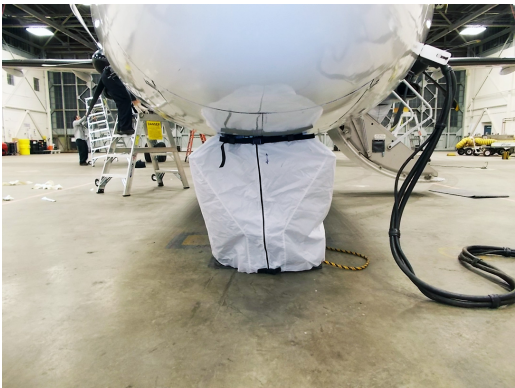
Q400, Nose gear landing/tire covers - Cold Weather Ops

ALL-YEAR USE MATERIAL - Made with Silver Acrylic Sunbrella canvas, the all-year use material is the best option for sun protection and cover longevity. This heavier more durable material is intended for all weather conditions, such as rain and snow or lots of sun.