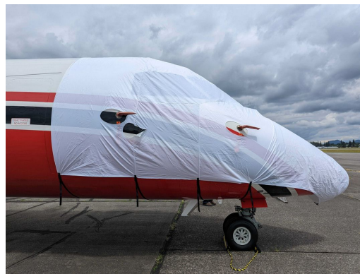
DeHavilland Dash 8, Q400 Cockpit/Nose Cover, test fit cover