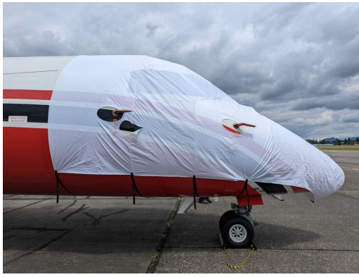
DeHavilland Dash 8, Q400 Cockpit/Nose Cover, test fit cover