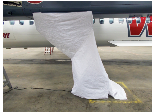
Q400, Main gear landing/tire covers - Cold Weather Ops