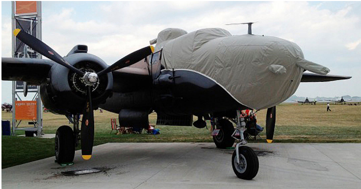
B25 Cockpit/Nose and Gun Turret Covers

This cover type is made from Silver Acrylic Sunbrella canvas and is 100% lined with a soft and smooth microfiber. Bruce's Custom Covers developed this material combination especially for aircraft protection. The outer material is medium weight and treated for water resistance, UV resistance and anti-static buildup. The inner lining is a very soft and smooth microfiber to prevent scratching. The material is very reflective, and tests show that the cabin interior temperature can be reduced to near-ambient temperature on the hottest of days. It is water, ice and snow repellent, yet breathable to allow moisture to escape from between the cover and the aircraft surface.