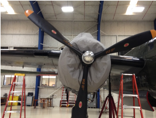
B25 Engine Cover