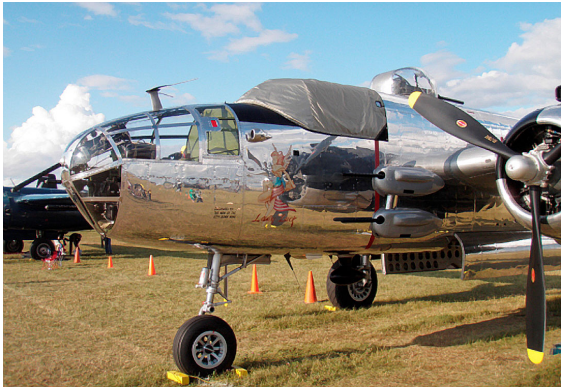
Mitchell B25 Cockpit Cover (Snap-On Type)