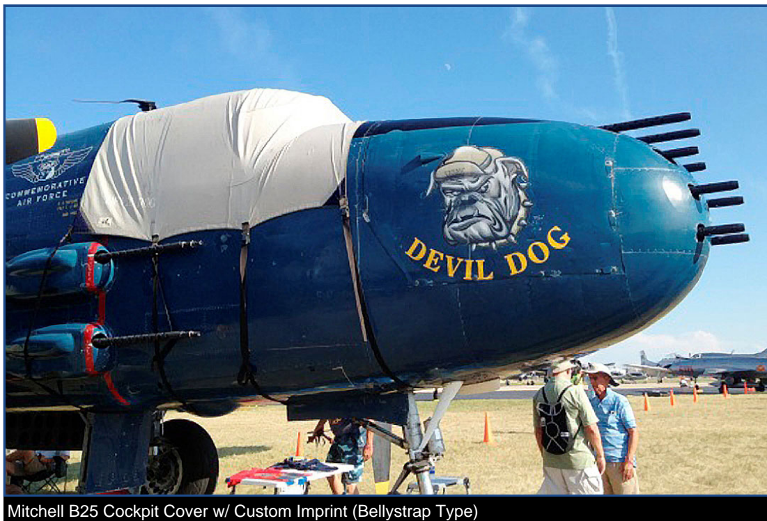
Mitchell B25 Cockpit Cover w/ Custom Imprint (Bellystrap Type)