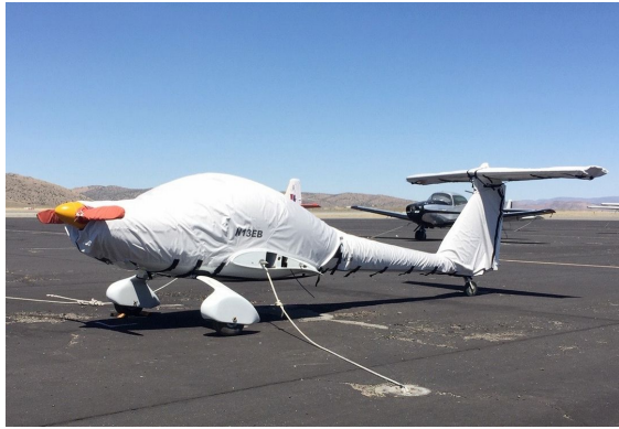
Dimona HK-36 Extended Canopy/Engine Cover, Empennage Cover Set

The Diamond HK-36, Super Dimona & Extreme Canopy/Engine Cover is a one-piece cover (100% lined with microfiber) that is a combination of the Canopy Cover and Engine Cover. This cover will enclose the engine cowl and will extend aft to cover all of the windows. This cover type is made from Silver Acrylic Sunbrella canvas and is 100% lined with a soft and smooth microfiber. Bruce's Custom Covers developed this material combination especially for aircraft protection. The outer material is medium weight and treated for water resistance, UV resistance and anti-static buildup. The inner lining is a very soft and smooth microfiber to prevent scratching. The material is very reflective, and tests show that the cabin interior temperature can be reduced to near-ambient temperature on the hottest of days. It is water, ice and snow repellent, yet breathable to allow moisture to escape from between the cover and the aircraft surface.