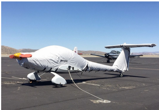
Dimona HK-36 Extended Canopy/Engine Cover, Empennage Cover Set

WINTER USE MATERIAL - Made with Solution-Dyed Polyester fabric, this option is intended for seasonal use to aid in deicing, rain mitigation, or for occasional travel. The material is lighter and more compact, but more susceptible to UV damage and may have a shorter useful life if used continuously outside than the all-year use material.