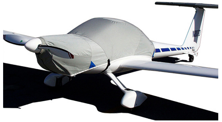
Diamond DA-20 Canopy/Engine Cover