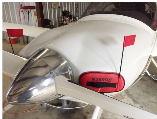
Diamond DA-20-C1 Engine Inlet Plugs