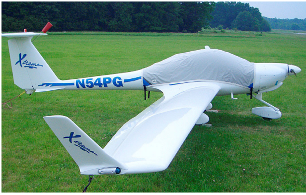
Dimona Xtreme Canopy Cover