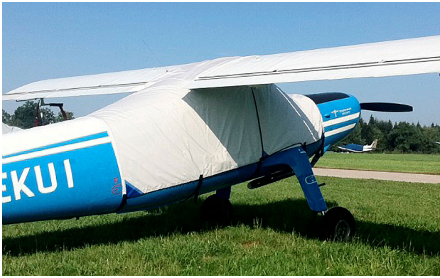
Dornier Do27 Canopy Cover, over-top type