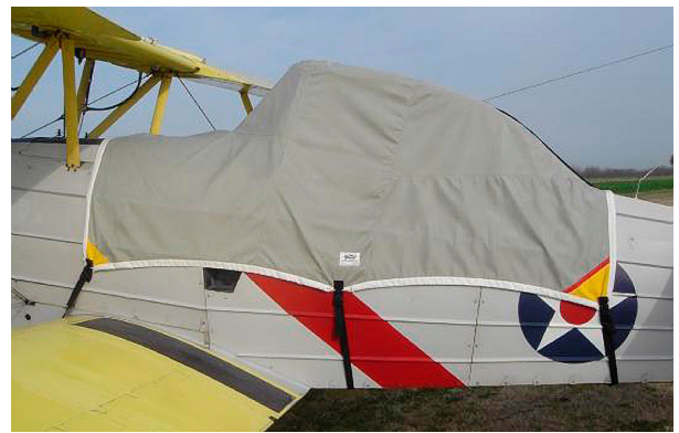
Grumman Ag Cat Canopy Cover