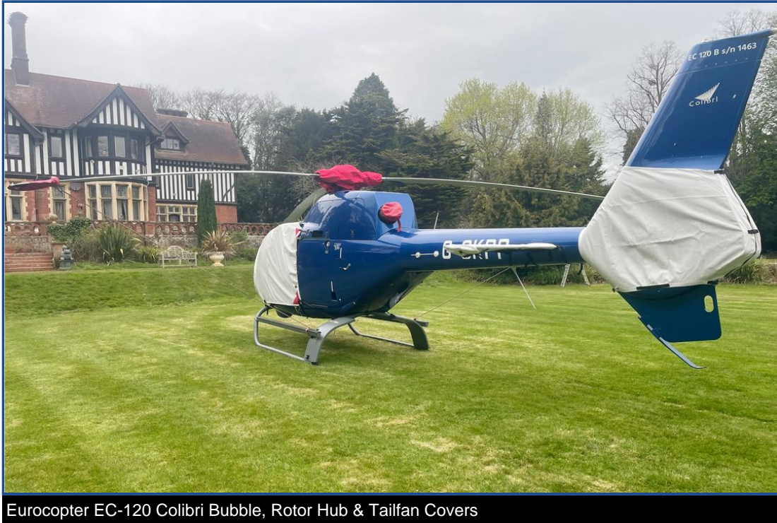
Eurocopter EC-120 Colibri Bubble, Rotor Hub &amp; Tailfan Covers