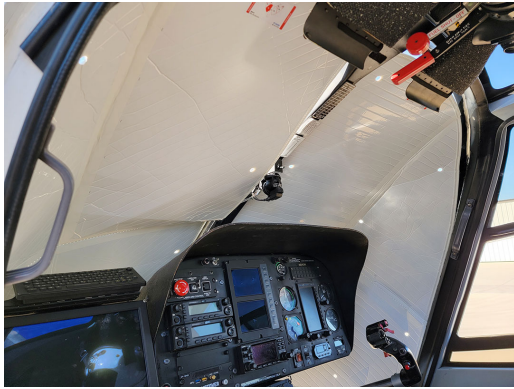
Eurocopter EC-120 Windshield HeatShields

Heatshields are interior sunshades for an aircraft's windows or canopy glass. The product is a unique composite of closed-cell foam with a silver mylar finish. The semi-rigid design is stiff enough to stand along the inside of the windshield using sun visors or window framing. It folds up flat and easily stores in the included storage sleeve. Some designs may require velcro and suction cups. A Heatshield is an excellent short-term remedy for cockpit overheating.