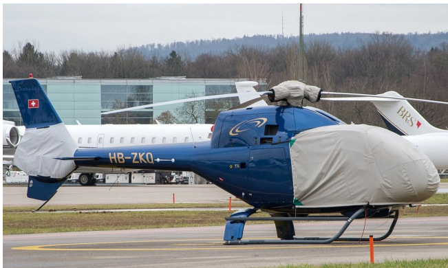
Eurocopter EC-120 Bubble, Rotor Mast & Tailfan Covers

The Tailboom Cover details vary by model, but generally the helicopter tail boom cover encloses the tail boom from the "bottleneck" to the aft end. They usually also cover the horizontal stabilizers, and are custom made to allow for antennae, lights, and other protrusions. They attach with straps underneath the tail boom. Covers for the vertical and horizontal stabilizers are also available separately. Specific information for each model is available on request.