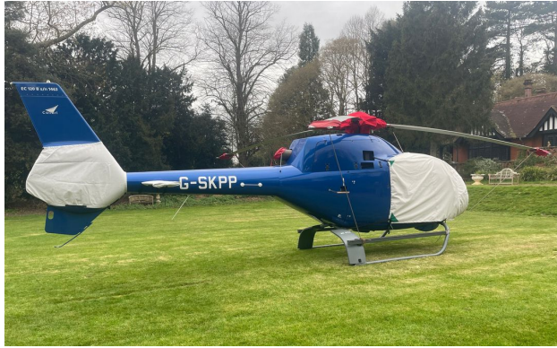
Eurocopter EC-120 Colibri Bubble, Rotor Hub & Tailfan Covers