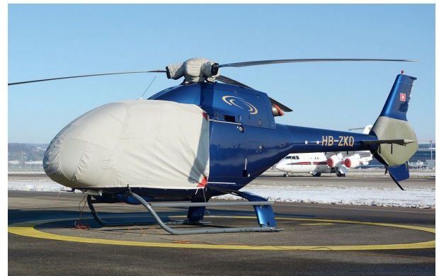
Eurocopter EC-120 Bubble, Rotor Mast & Tailfan Covers