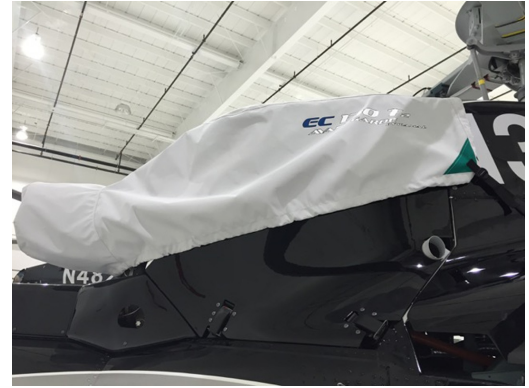
EC-130 Engine Area/Exhaust Cover