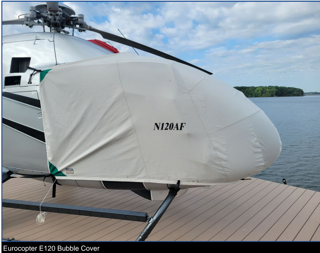
Eurocopter E120 Bubble Cover