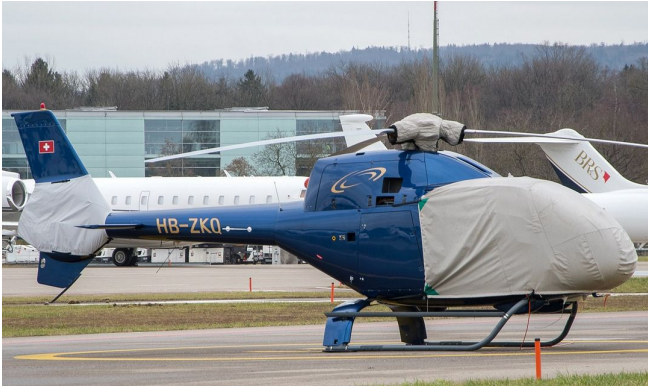
Eurocopter EC-120 Bubble, Rotor Mast & Tailfan Covers

Insulated Covers Material - A special composite material of solution-dyed polyester, 3M Thinsulate insulation, and soft nylon interior fabric. Our insulated covers are designed to complement an engine preheater and help retain heat in the engine compartment after shutdown. If you operate your aircraft in cold-weather, these covers will help prevent engine wear and tear.