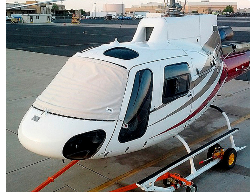
AS350 Windshield Cover, pinches in door jambs