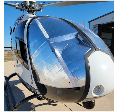
Eurocopter EC-120 Windshield HeatShields