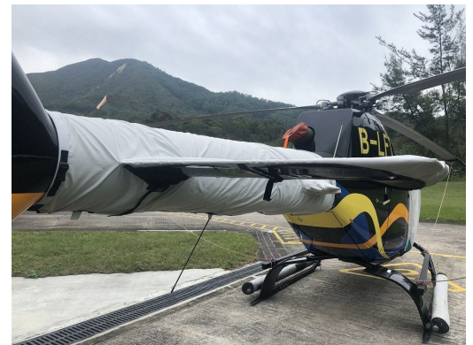
Eurocopter EC-120B Tailboom Cover