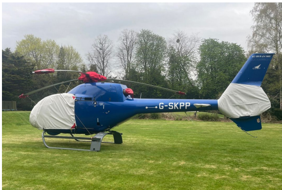
Eurocopter EC-120 Colibri Bubble, Rotor Hub & Tailfan Covers

The Tailboom Cover details vary by model, but generally the helicopter tail boom cover encloses the tail boom from the "bottleneck" to the aft end. They usually also cover the horizontal stabilizers, and are custom made to allow for antennae, lights, and other protrusions. They attach with straps underneath the tail boom. Covers for the vertical and horizontal stabilizers are also available separately. Specific information for each model is available on request.