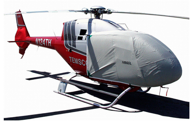
Eurocopter EC-120 Bubble Cover & Tailfan Cover