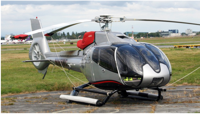
Intake/Exhaust Cover, Rotor Hub Cover (w/ skirt) & Blade Tie Downs

tight at the blade root with straps and quick-release plastic buckles. The Cold Weather Blade Covers are fitted with full-length zippers and optional deice “boots” designed to accept a preheater hose; a small opening at the tip of the cover allows for some air circulation and drainage in freezing weather. Some part numbers have features for an extra charge.