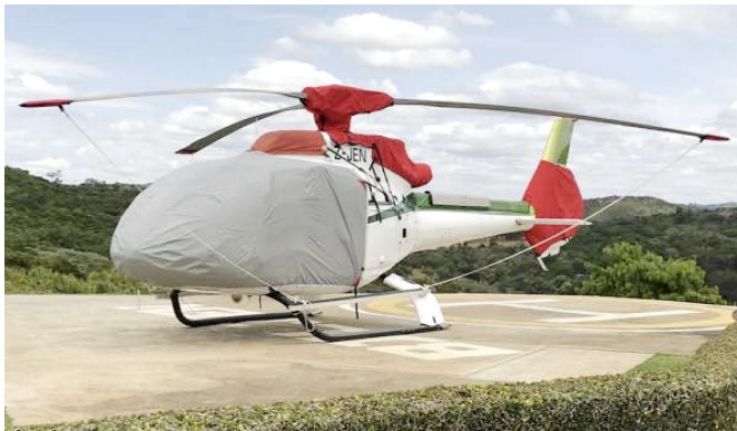
EC130 Bubble, Intake, Exhaust, Rotor Hub & Tailfan Covers

The Tailboom Cover details vary by model, but generally the helicopter tail boom cover encloses the tail boom from the "bottleneck" to the aft end. They usually also cover the horizontal stabilizers, and are custom made to allow for antennae, lights, and other protrusions. They attach with straps underneath the tail boom. Covers for the vertical and horizontal stabilizers are also available separately. Specific information for each model is available on request.