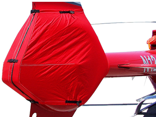
Eurocopter EC-120 Tailfan Cover

The Tailboom Cover details vary by model, but generally the helicopter tail boom cover encloses the tail boom from the "bottleneck" to the aft end. They usually also cover the horizontal stabilizers, and are custom made to allow for antennae, lights, and other protrusions. They attach with straps underneath the tail boom. Covers for the vertical and horizontal stabilizers are also available separately. Specific information for each model is available on request.