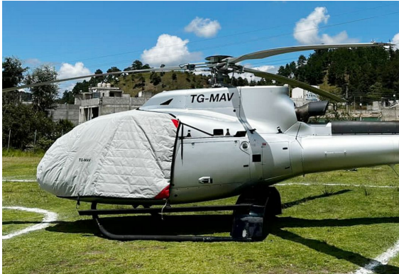
Airbus H-130 Insulated Bubble Cover

This cover type is made from Silver Acrylic Sunbrella canvas and is 100% lined with a soft and smooth microfiber. Bruce's Custom Covers developed this material combination especially for aircraft protection. The outer material is medium weight and treated for water resistance, UV resistance and anti-static buildup. The inner lining is a very soft and smooth microfiber to prevent scratching. The material is very reflective, and tests show that the cabin interior temperature can be reduced to near-ambient temperature on the hottest of days. It is water, ice and snow repellent, yet breathable to allow moisture to escape from between the cover and the aircraft surface.