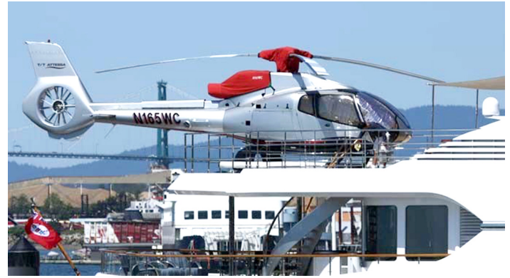
Intake/Exhaust Cover & Rotor Hub Cover (w/ skirt)