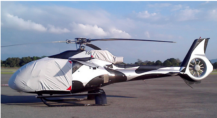
Bubble Cover and Intake/Exhaust Cover