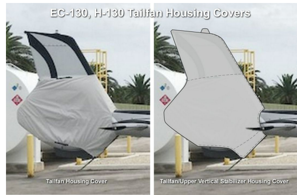
Airbus Helicopter H-130 Tailfan Housing Covers