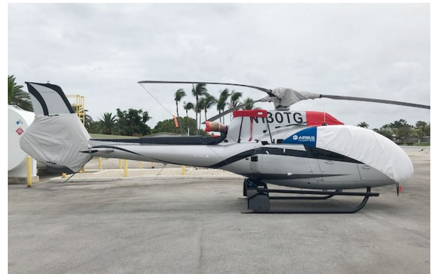
AIRBUS H130 T2, Intake, Exhaust & Tailfan Covers