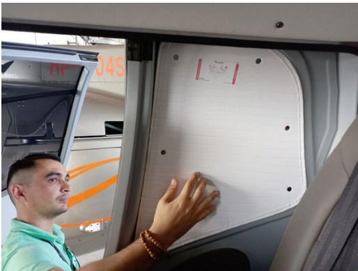
Airbus Helicopter EC130 B4 Side Window Heatshields