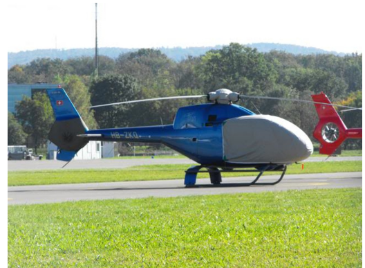
EC-130 Bubble, Tailfan, and Rotor Hub Cover