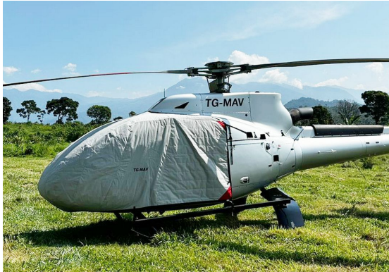
Airbus H-130 Insulated Bubble Cover

This cover type is made from Silver Acrylic Sunbrella canvas and is 100% lined with a soft and smooth microfiber. Bruce's Custom Covers developed this material combination especially for aircraft protection. The outer material is medium weight and treated for water resistance, UV resistance and anti-static buildup. The inner lining is a very soft and smooth microfiber to prevent scratching. The material is very reflective, and tests show that the cabin interior temperature can be reduced to near-ambient temperature on the hottest of days. It is water, ice and snow repellent, yet breathable to allow moisture to escape from between the cover and the aircraft surface.