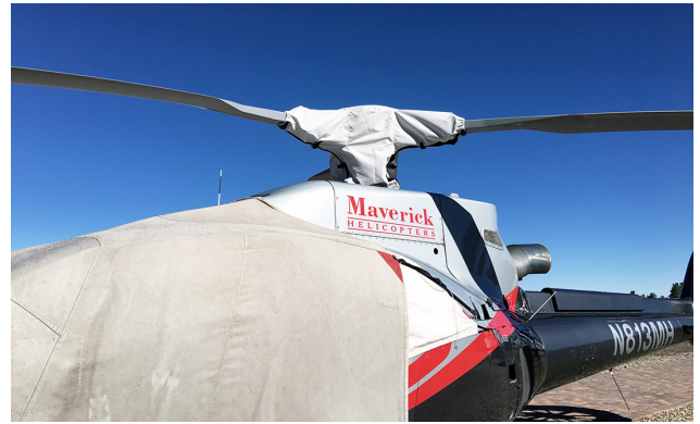
Eurocopter EC-130 Main Rotor Hub Cover