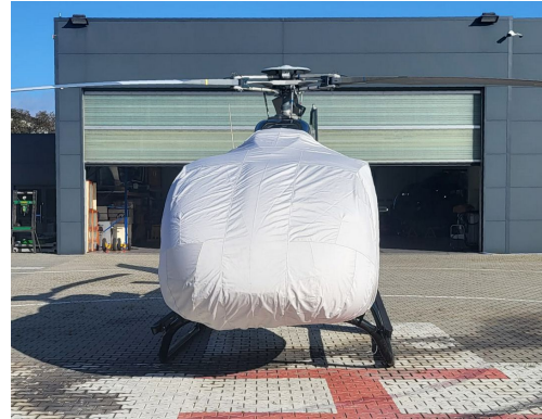
Airbus Helicopter H-130 Bubble Cover, Extends To Cover Fwd Engine Inlet