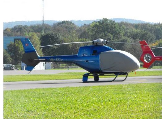
EC-130 Bubble, Tailfan, and Rotor Hub Cover