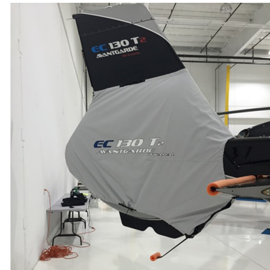
EC-130 Tailfan Cover