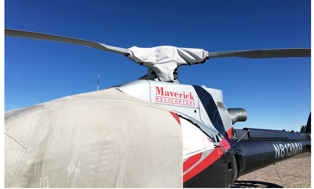
Eurocopter EC-130 Main Rotor Hub Cover