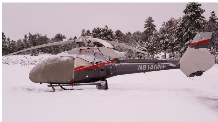
Intake/Exhaust Cover, Rotor Hub Cover (w/ skirt) & Blade Tie Downs