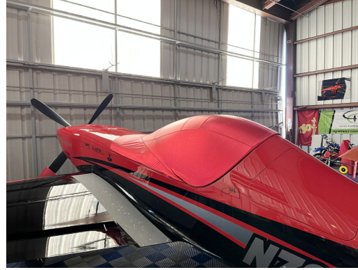
Gamebird GB-1 Solar Cap (single place), CUSTOM COVERS & IMPRINTING AVAILABLE!