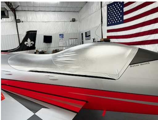
Extra NG Models Canopy Cover (SOLAR CAP EXAMPLE)

This cover type is made from Silver Acrylic Sunbrella canvas and is 100% lined with a soft and smooth microfiber. Bruce's Custom Covers developed this material combination especially for aircraft protection. The outer material is medium weight and treated for water resistance, UV resistance and anti-static buildup. The inner lining is a very soft and smooth microfiber to prevent scratching. The material is very reflective, and tests show that the cabin interior temperature can be reduced to near-ambient temperature on the hottest of days. It is water, ice and snow repellent, yet breathable to allow moisture to escape from between the cover and the aircraft surface.