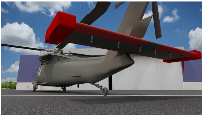
Padded Horizontal Stab Covers, Wingtip Pads (illustration)

Designed to prevent damage to the aircraft extremities in crowded hangars, these products are made of bright red Naugahyde and thickly padded with a sandwich of closed cell foam. Nowadays they are also made using bright read Neoprene padded laminated (think: wetsuit material).