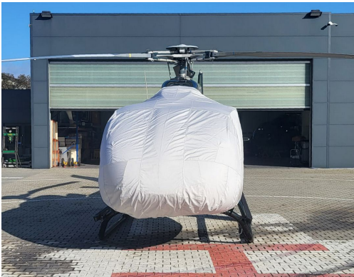
WINDSHIELD/NOSE COVER, pinches into door jambs Airbus Helicopter H-130 Bubble Cover, Extends To Cover Fwd Engine Inlet