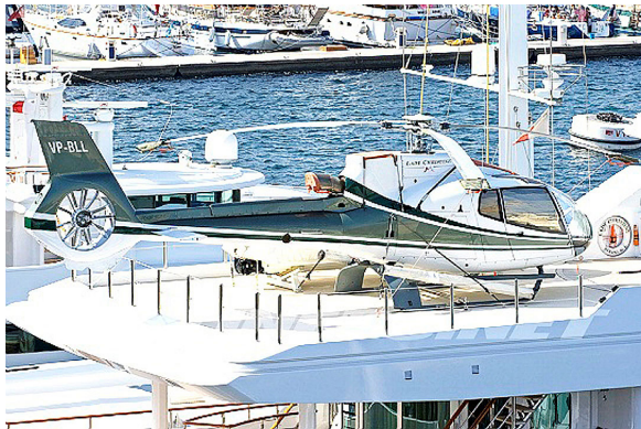
EC-130 Front, Side and Skylight Window HeatShields

Heatshields are interior sunshades for an aircraft's windows or canopy glass. The product is a unique composite of closed-cell foam with a silver mylar finish. The semi-rigid design is stiff enough to stand along the inside of the windshield using sun visors or window framing. It folds up flat and easily stores in the included storage sleeve. Some designs may require velcro and suction cups. A Heatshield is an excellent short-term remedy for cockpit overheating.