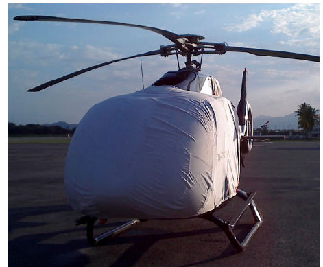
Bubble Cover and Intake/Exhaust Cover