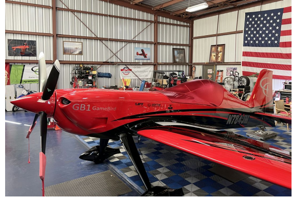
Gamebird GB-1 Solar Cap (single place), CUSTOM COVERS & IMPRINTING AVAILABLE! Gamebird GB-1 Solar Cap (single place), CUSTOM COVERS & IMPRINTING AVAILABLE!