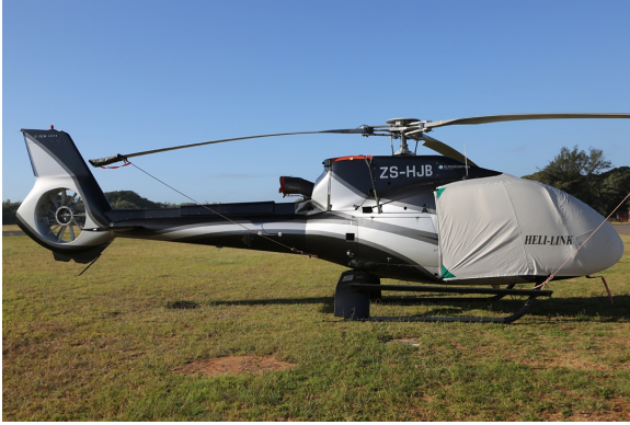
EC-130 Bubble Cover

The material is very reflective, and tests show that the cabin interior temperature can be reduced to near-ambient temperature on the hottest of days. It is water, ice and snow repellent, yet breathable to allow moisture to escape from between the cover and the aircraft surface.