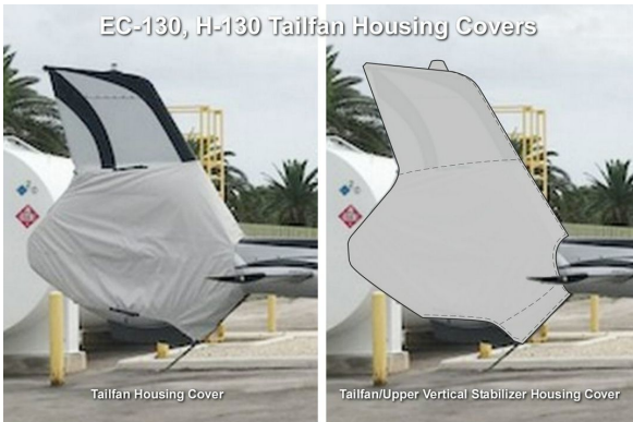
Airbus Helicopter H-130 Tailfan Housing Covers

The Tailboom Cover details vary by model, but generally the helicopter tail boom cover encloses the tail boom from the "bottleneck" to the aft end. They usually also cover the horizontal stabilizers, and are custom made to allow for antennae, lights, and other protrusions. They attach with straps underneath the tail boom. Covers for the vertical and horizontal stabilizers are also available separately. Specific information for each model is available on request.