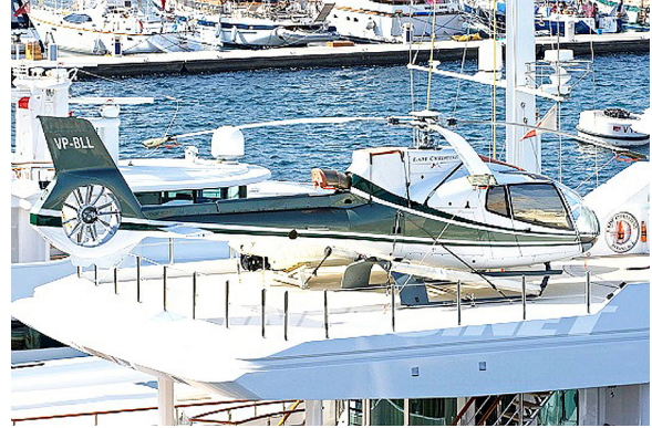
EC-130 Front, Side and Skylight Window HeatShields