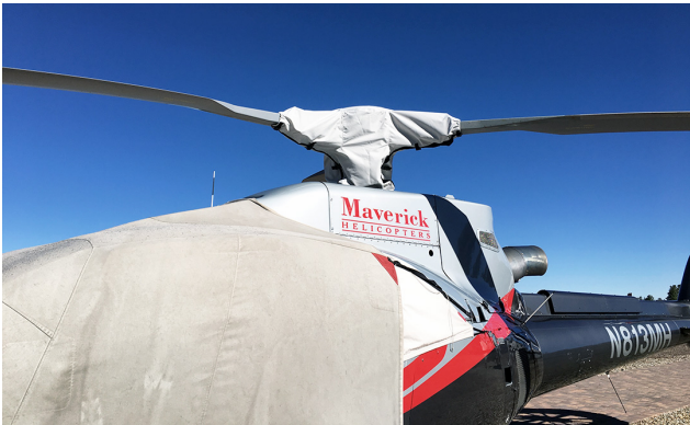
Eurocopter EC-130 Main Rotor Hub Cover

circulation and drainage in freezing weather. Some part numbers have features for an extra charge.