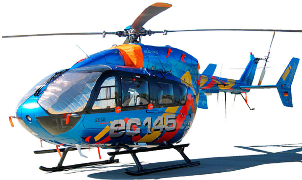
EC-145 Cabin Heatshield Set

Heatshields are interior sunshades for an aircraft's windows or canopy glass. The product is a unique composite of closed-cell foam with a silver mylar finish. The semi-rigid design is stiff enough to stand along the inside of the windshield using sun visors or window framing. It folds up flat and easily stores in the included storage sleeve. Some designs may require velcro and suction cups. A Heatshield is an excellent short-term remedy for cockpit overheating.