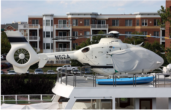
Eurocopter EC-135 Bubble Cover

This cover type is made from Silver Acrylic Sunbrella canvas and is 100% lined with a soft and smooth microfiber. Bruce's Custom Covers developed this material combination especially for aircraft protection. The outer material is medium weight and treated for water resistance, UV resistance and anti-static buildup. The inner lining is a very soft and smooth microfiber to prevent scratching. The material is very reflective, and tests show that the cabin interior temperature can be reduced to near-ambient temperature on the hottest of days. It is water, ice and snow repellent, yet breathable to allow moisture to escape from between the cover and the aircraft surface.