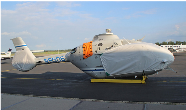
Eurocopter EC-135 Bubble & Tailfan Covers

The Tailboom Cover details vary by model, but generally the helicopter tail boom cover encloses the tail boom from the "bottleneck" to the aft end. They usually also cover the horizontal stabilizers, and are custom made to allow for antennae, lights, and other protrusions. They attach with straps underneath the tail boom. Covers for the vertical and horizontal stabilizers are also available separately. Specific information for each model is available on request.