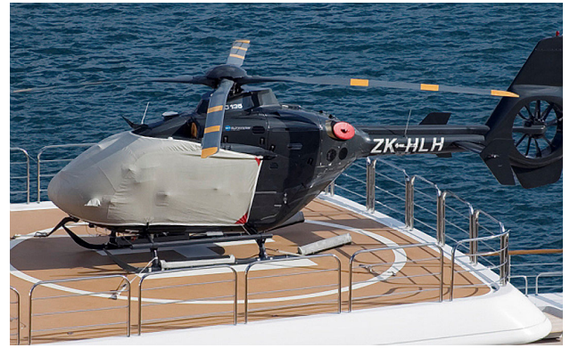
EC-135 Bubble Cover & Exhaust Plugs