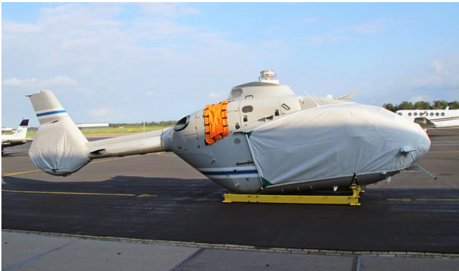
Bubble Cover and Tailfan Cover

The Tailboom Cover details vary by model, but generally the helicopter tail boom cover encloses the tail boom from the "bottleneck" to the aft end. They usually also cover the horizontal stabilizers, and are custom made to allow for antennae, lights, and other protrusions. They attach with straps underneath the tail boom. Covers for the vertical and horizontal stabilizers are also available separately. Specific information for each model is available on request.