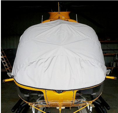
EC-135 Windshield/Skylights Cover, pinches in door jambs

This cover type is made from Silver Acrylic Sunbrella canvas and is 100% lined with a soft and smooth microfiber. Bruce's Custom Covers developed this material combination especially for aircraft protection. The outer material is medium weight and treated for water resistance, UV resistance and anti-static buildup. The inner lining is a very soft and smooth microfiber to prevent scratching. The material is very reflective, and tests show that the cabin interior temperature can be reduced to near-ambient temperature on the hottest of days. It is water, ice and snow repellent, yet breathable to allow moisture to escape from between the cover and the aircraft surface.