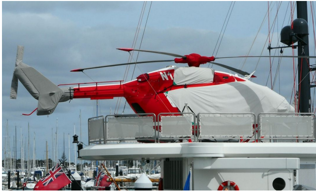
Eurocopter EC-135 Bubble, Engine, Rotor Hub, Tail Surfaces Covers

The Eurocopter EC-135 Intake Cover . Details vary by model, but generally helicopter intake covers are designed to enclose the intake area only. They are smaller than helicopter engine covers, and their attachment details can vary from straps, to snaps, or some combination of the two. Specific information for each model is available on request.