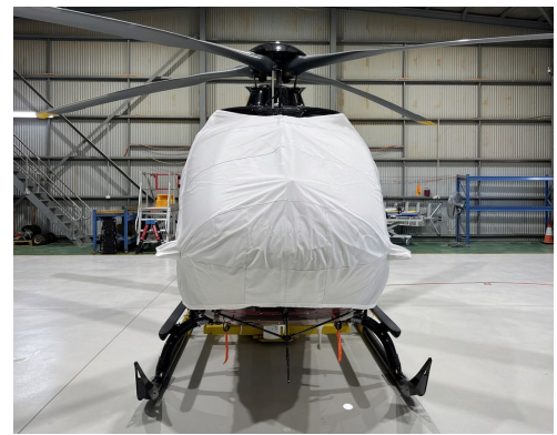
Airbus EC-135 Bubble Cover (with Wire Strike)