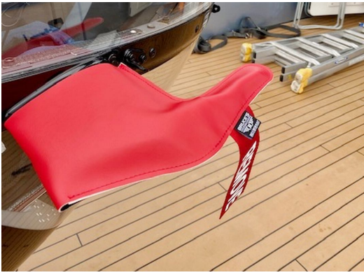
Airbus Helicopter H145 Pitot Tube Cover