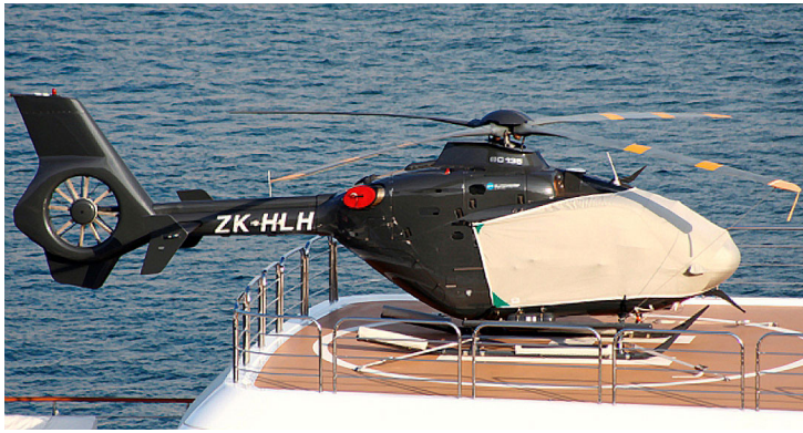
EC-135 Bubble Cover & Exhaust Plugs