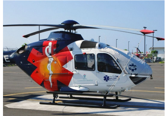
Eurocopter EC-135 Windshield/Skylight Cover