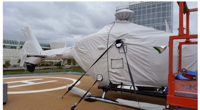
EC-135 Full Cover Set