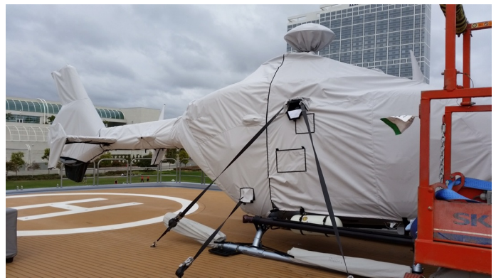
EC-135 Full Cover Set