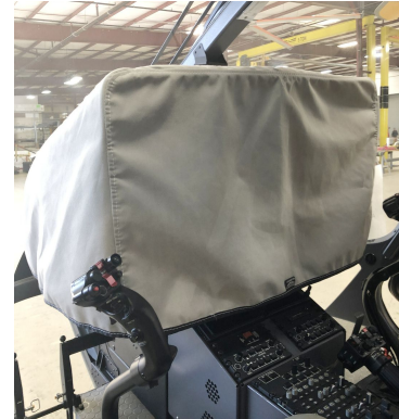
Eurocopter EC-135 Instrument Panel Heatshield Cover