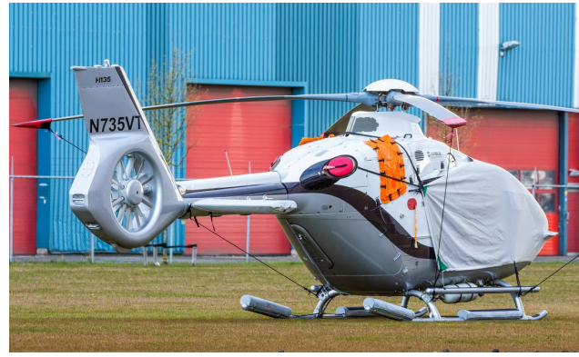
Airbus EC135T3 Blade Tie-Downs