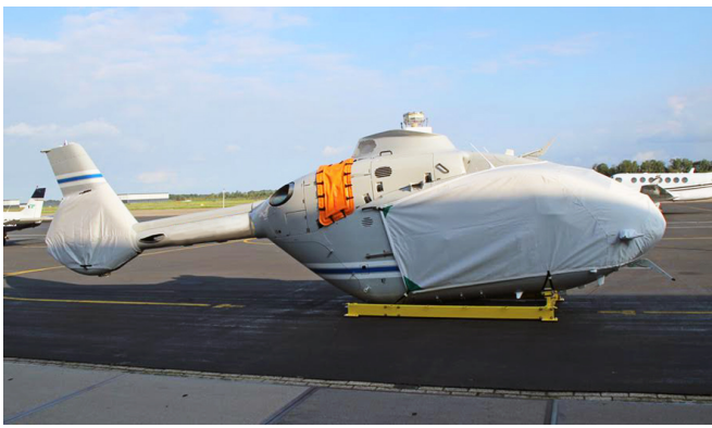
Bubble Cover and Tailfan Cover