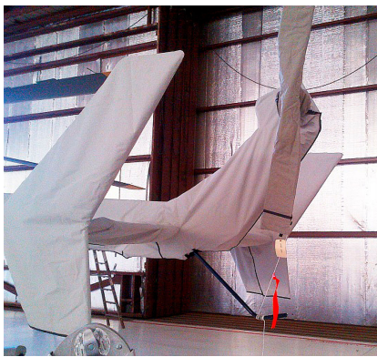
Tail Rotor Cover & Tailboom, Vertical Pylon & Stabilizers Cover