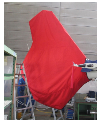
Airbus EC145 Tailfan Housing Fenestron Cover