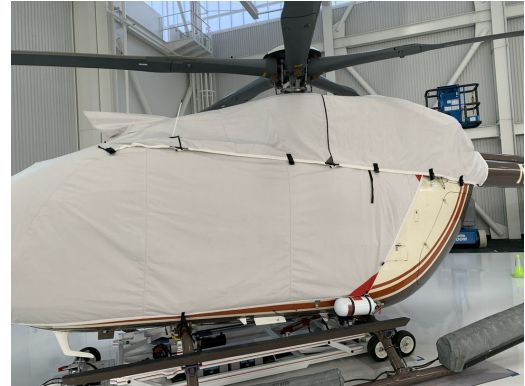
Eurocopter 145 Engine Area Cover, Bubble Cover