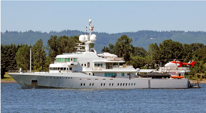
Eurocopter EC-145 Bubble Cover

This cover type is made from Silver Acrylic Sunbrella canvas and is 100% lined with a soft and smooth microfiber. Bruce's Custom Covers developed this material combination especially for aircraft protection. The outer material is medium weight and treated for water resistance, UV resistance and anti-static buildup. The inner lining is a very soft and smooth microfiber to prevent scratching. The material is very reflective, and tests show that the cabin interior temperature can be reduced to near-ambient temperature on the hottest of days. It is water, ice and snow repellent, yet breathable to allow moisture to escape from between the cover and the aircraft surface.