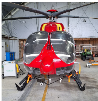
Airbus Helicopter H145D3 Windshield Heatshields, Engine Plugs

Heatshields are interior sunshades for an aircraft's windows or canopy glass. The product is a unique composite of closed-cell foam with a silver mylar finish. The semi-rigid design is stiff enough to stand along the inside of the windshield using sun visors or window framing. It folds up flat and easily stores in the included storage sleeve. Some designs may require velcro and suction cups. A Heatshield is an excellent short-term remedy for cockpit overheating.