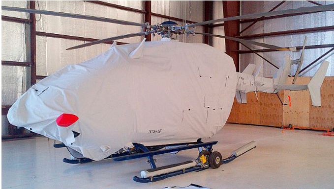
Main Body (also covers bottom), Tailboom, Vertical Pylon, Stabilizers and Tail Rotor Covers

This cover type is made from Silver Acrylic Sunbrella canvas and is 100% lined with a soft and smooth microfiber. Bruce's Custom Covers developed this material combination especially for aircraft protection. The outer material is medium weight and treated for water resistance, UV resistance and anti-static buildup. The inner lining is a very soft and smooth microfiber to prevent scratching. The material is very reflective, and tests show that the cabin interior temperature can be reduced to near-ambient temperature on the hottest of days. It is water, ice and snow repellent, yet breathable to allow moisture to escape from between the cover and the aircraft surface.