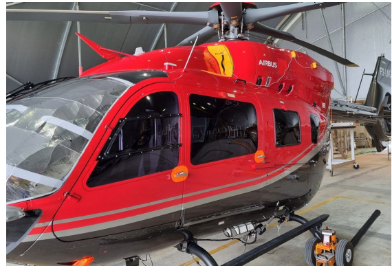
Airbus Helicopter H145D3 Intake Plugs