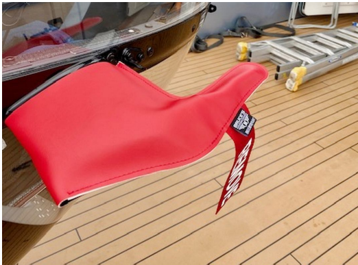
Airbus Helicopter H145 Pitot Tube Cover

The Engine Inlet Plugs are custom fit for your Eurocopter EC-145, UH-145, BK-117 D-2 intakes, made with heavy-duty vinyl material, and stuffed with a single block of sculpted urethane foam. Each plug has a zipper that allows the foam to be removed and dried if necessary. Engine plugs have 'Remove Before Flight' streamers sewn onto the face of the plugs. Most plugs are imprinted with the aircraft registration number in black for an extra charge. Storage bag NOT included. Engine plugs may be inserted after flight when the engine is still warm. Engine Inlet Plugs are commonly referred to as Cowl Plugs, Intake Plugs, Cowl Blocks, Engine Blocks, and Engine Bungs.