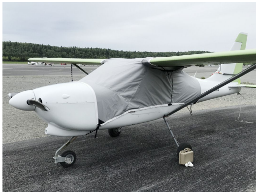
Glasair Aviation Glastar, Sportsman 2+2 Travel Cover, Light Weight Travel Canopy Cover

Travel Covers are made with Silver Solution-Dyed Polyester fabric and only lined over the windshield to save weight. The material is lightweight and more compact for easy stowage in the aircraft. The polyester material is water resistant, but only intended for occasional use outside. We also have an ultra lightweight material available for fitted hangar dust covers. For daily outdoor use, the non-travel Sunbrella Cover is the best choice.