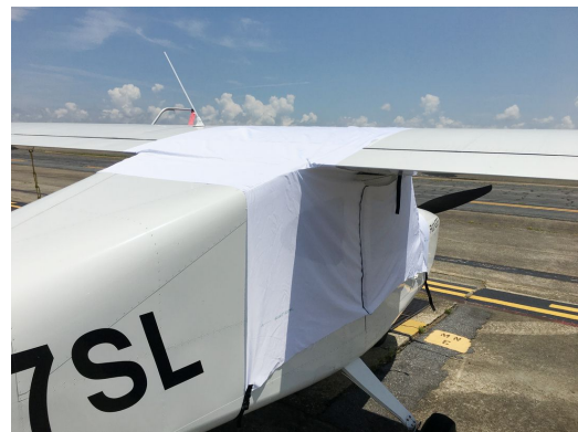
Vashon Ranger VR-7 Canopy Cover, test fit cover