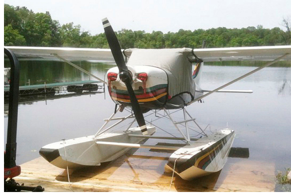
Glstar Sportsman Canopy Cover and Engine Plugs