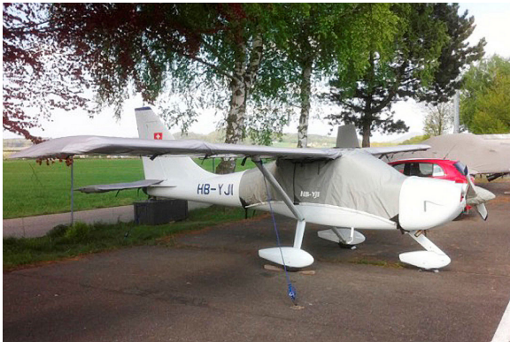
OMF Symphony Canopy, Wings, Horiz. Stab, and Prop Covers

This cover type is made from Silver Acrylic Sunbrella canvas and is 100% lined with a soft and smooth microfiber. Bruce's Custom Covers developed this material combination especially for aircraft protection. The outer material is medium weight and treated for water resistance, UV resistance and anti-static buildup. The inner lining is a very soft and smooth microfiber to prevent scratching. The material is very reflective, and tests show that the cabin interior temperature can be reduced to near-ambient temperature on the hottest of days. It is water, ice and snow repellent, yet breathable to allow moisture to escape from between the cover and the aircraft surface.