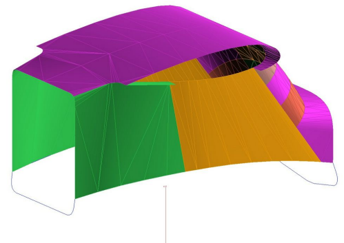
Vashon R-7 Ranger Canopy Cover, 3D model