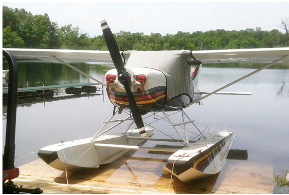
Glastar Sportsman Canopy Cover and Engine Plugs

This cover type is made from Silver Acrylic Sunbrella canvas and is 100% lined with a soft and smooth microfiber. Bruce's Custom Covers developed this material combination especially for aircraft protection. The outer material is medium weight and treated for water resistance, UV resistance and anti-static buildup. The inner lining is a very soft and smooth microfiber to prevent scratching. The material is very reflective, and tests show that the cabin interior temperature can be reduced to near-ambient temperature on the hottest of days. It is water, ice and snow repellent, yet breathable to allow moisture to escape from between the cover and the aircraft surface.