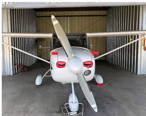
2006 OMF Symphony SA160

a single block of sculpted urethane foam. Each plug has a zipper that allows the foam to be removed and dried if necessary. Engine plugs have warning flags that are visible from the cockpit or 'remove before flight' streamers sewn onto the face of the plugs. Most plugs are imprinted with the aircraft registration number in black for an extra charge. Storage bag NOT included. Engine plugs may be inserted after flight when the engine is still warm. Engine Inlet Plugs are commonly referred to as Cowl Plugs, Intake Plugs, Cowl Blocks, Engine Blocks, and Engine Bungs.