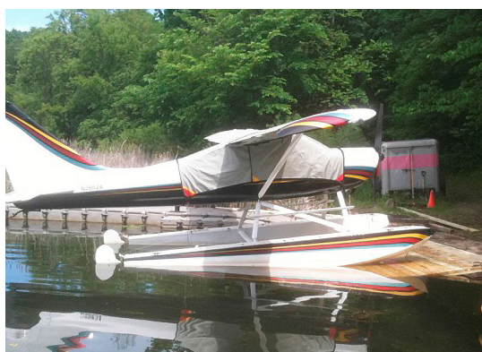
Glastar Sportsman Canopy Cover