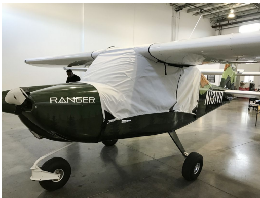
Vashon Ranger R7 Canopy Cover

This cover type is made from Silver Acrylic Sunbrella canvas and is 100% lined with a soft and smooth microfiber. Bruce's Custom Covers developed this material combination especially for aircraft protection. The outer material is medium weight and treated for water resistance, UV resistance and anti-static buildup. The inner lining is a very soft and smooth microfiber to prevent scratching. The material is very reflective, and tests show that the cabin interior temperature can be reduced to near-ambient temperature on the hottest of days. It is water, ice and snow repellent, yet breathable to allow moisture to escape from between the cover and the aircraft surface.