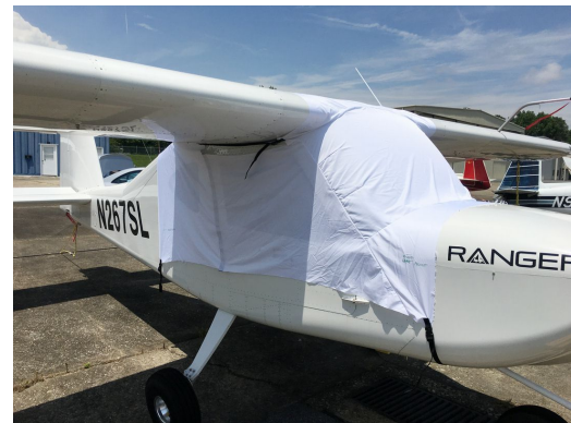
Vashon Ranger VR-7 Canopy Cover, test fit cover