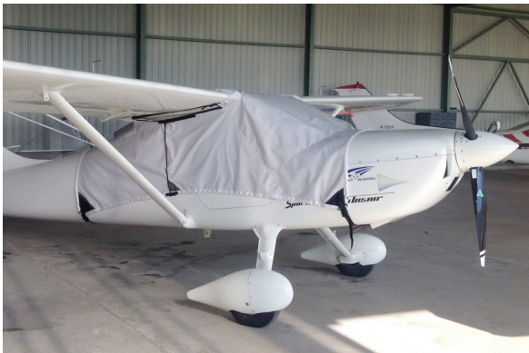
Glasair Aviation Glastar, Sportsman 2+2 Canopy Cover (Over-The-Top Style)