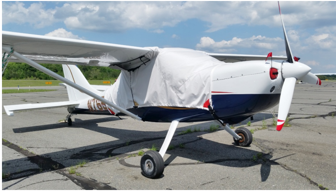
Glastar Over-Top Canopy Cover, Engine Plugs

plugs have warning flags that are visible from the cockpit or 'remove before flight' streamers sewn onto the face of the plugs. Most plugs are imprinted with the aircraft registration number in black for an extra charge. Storage bag NOT included. Engine plugs may be inserted after flight when the engine is still warm. Engine Inlet Plugs are commonly referred to as Cowl Plugs, Intake Plugs, Cowl Blocks, Engine Blocks, and Engine Bungs.