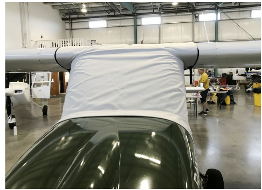
Vashon Ranger R7 Canopy Cover