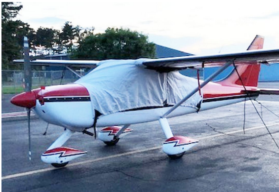
Glasair Aviation Glastar, Sportsman 2+2 Canopy Cover (Over-The-Top Style)

This cover type is made from Silver Acrylic Sunbrella canvas and is 100% lined with a soft and smooth microfiber. Bruce's Custom Covers developed this material combination especially for aircraft protection. The outer material is medium weight and treated for water resistance, UV resistance and anti-static buildup. The inner lining is a very soft and smooth microfiber to prevent scratching. The material is very reflective, and tests show that the cabin interior temperature can be reduced to near-ambient temperature on the hottest of days. It is water, ice and snow repellent, yet breathable to allow moisture to escape from between the cover and the aircraft surface.