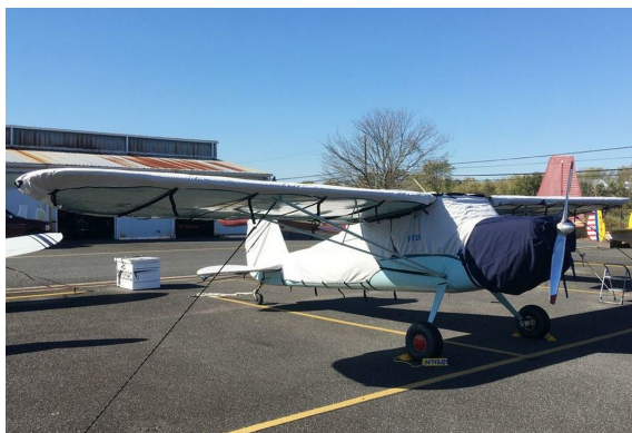
Cessna 140 Insulated Engine, Canopy, Empennage & Wing Covers