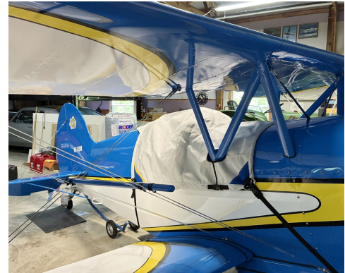
EAA Acro Sport Biplane Canopy Cover