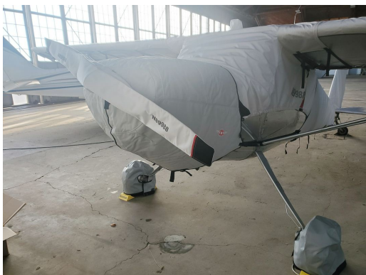
Cessna 140 Canopy, Wings, Prop, Tires & Empennage Covers

WINTER USE MATERIAL - Made with Solution-Dyed Polyester fabric, this option is intended for seasonal use to aid in deicing, rain mitigation, or for occasional travel. The material is lighter and more compact, but more susceptible to UV damage and may have a shorter useful life if used continuously outside than the all-year use material.