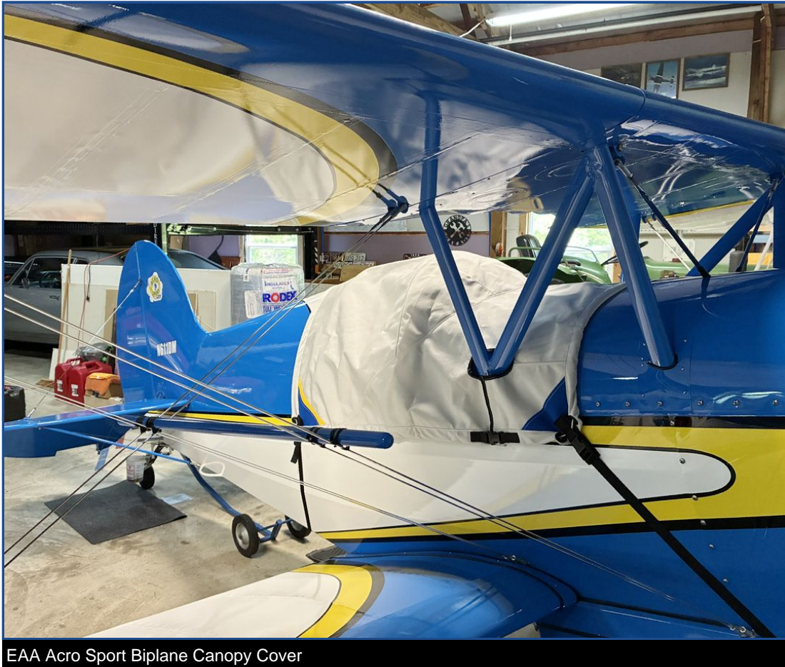
EAA Acro Sport Biplane Canopy Cover