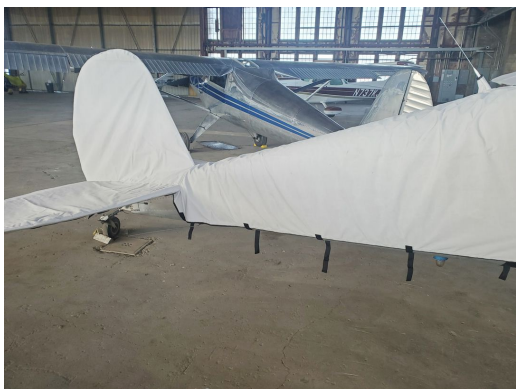
Cessna 140 Empennage Cover

WINTER USE MATERIAL - Made with Solution-Dyed Polyester fabric, this option is intended for seasonal use to aid in deicing, rain mitigation, or for occasional travel. The material is lighter and more compact, but more susceptible to UV damage and may have a shorter useful life if used continuously outside than the all-year use material.