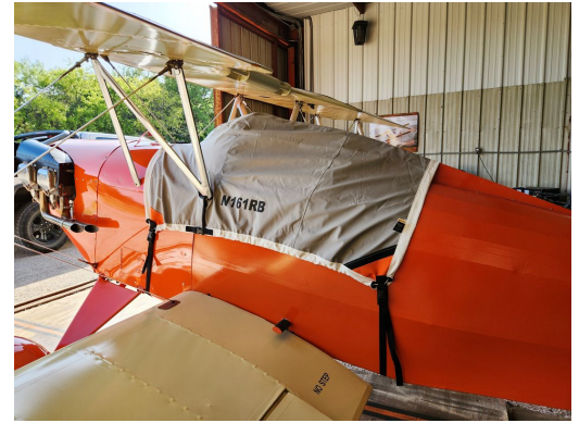
Burt Special Canopy Cover