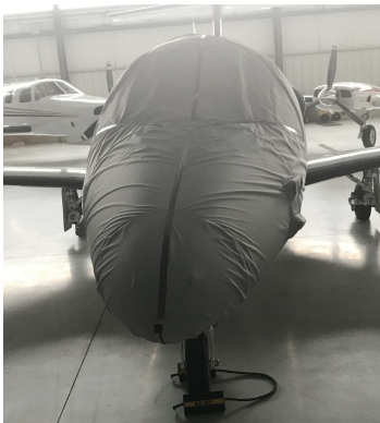
Eclipse EA550 Travel Canopy/Nose Cover

This cover type is made from Silver Acrylic Sunbrella canvas and is 100% lined with a soft and smooth microfiber. Bruce's Custom Covers developed this material combination especially for aircraft protection. The outer material is medium weight and treated for water resistance, UV resistance and anti-static buildup. The inner lining is a very soft and smooth microfiber to prevent scratching. The material is very reflective, and tests show that the cabin interior temperature can be reduced to near-ambient temperature on the hottest of days. It is water, ice and snow repellent, yet breathable to allow moisture to escape from between the cover and the aircraft surface.