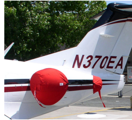
Eclipse Engine Covers, Bruce's design