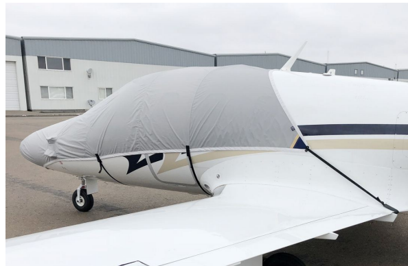
Customized to end before main antenna, with easy to use flat-hook straps.