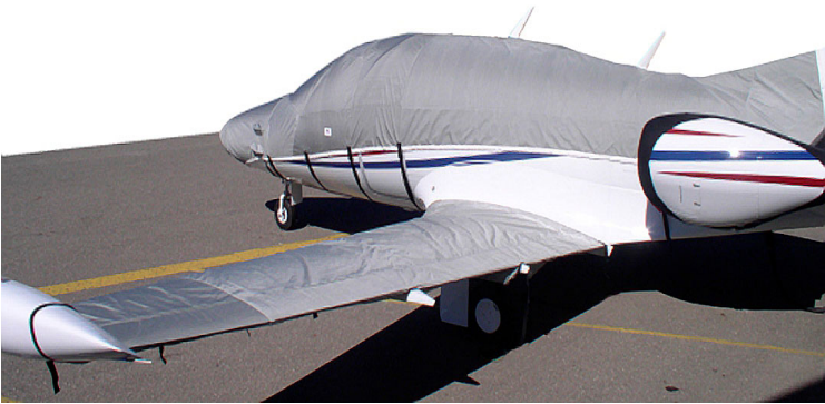
Fuselage Cover & Wing Covers with hail protection on all upper surfaces

WINTER USE MATERIAL - Made with Solution-Dyed Polyester fabric, this option is intended for seasonal use to aid in deicing, rain mitigation, or for occasional travel. The material is lighter and more compact, but more susceptible to UV damage and may have a shorter useful life if used continuously outside than the all-year use material.