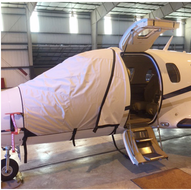
Eclipse Cockpit Door Cover, with Pitot Tube Covers

This cover type is made from Silver Acrylic Sunbrella canvas and is 100% lined with a soft and smooth microfiber. Bruce's Custom Covers developed this material combination especially for aircraft protection. The outer material is medium weight and treated for water resistance, UV resistance and anti-static buildup. The inner lining is a very soft and smooth microfiber to prevent scratching. The material is very reflective, and tests show that the cabin interior temperature can be reduced to near-ambient temperature on the hottest of days. It is water, ice and snow repellent, yet breathable to allow moisture to escape from between the cover and the aircraft surface.