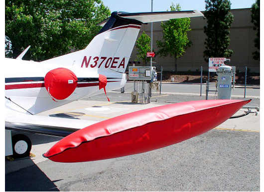
Eclipse Tip Tank & Engine Covers