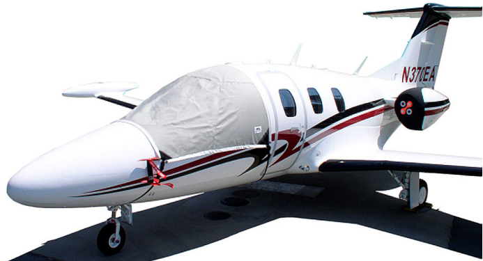
Eclipse Windshield Cover, Pitot Covers & "Bikini" style Engine Covers