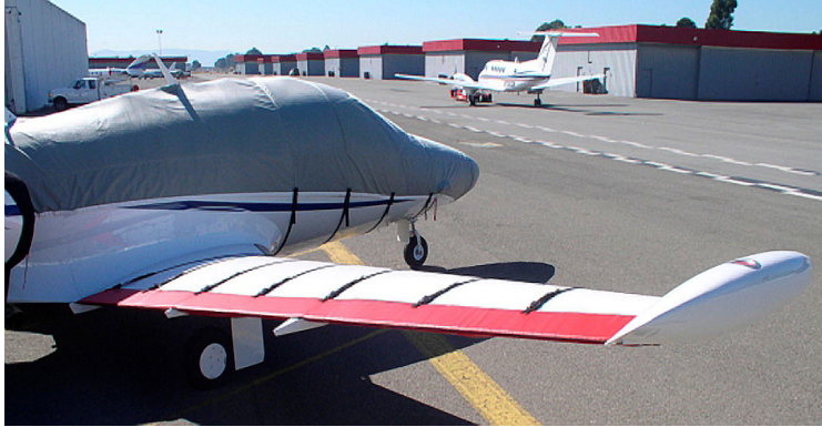
Fuselage Cover with Hail Protection & Wing Control Surfaces Hail Protection Pads

Designed to prevent damage to the aircraft extremities in crowded hangars, these products are made of bright red Naugahyde and thickly padded with a sandwich of closed cell foam.