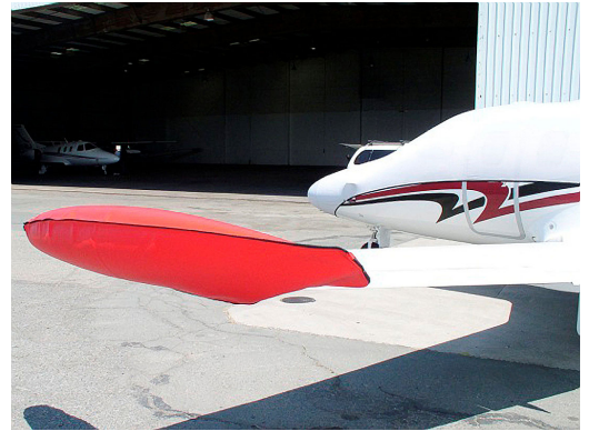
Eclipse Tip Tank Cover