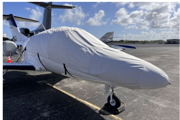
Eclipse EA500 Canopy/Nose Cover