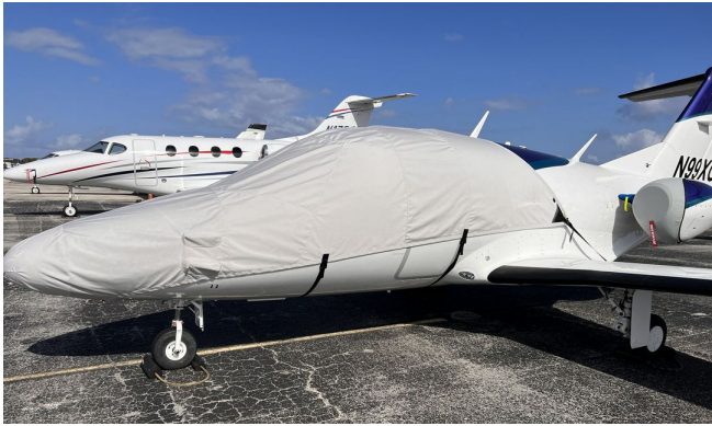
Eclipse EA500 Canopy/Nose Cover

The Eclipse EA500, TE500, 550 Bikini Style Engine Covers are a single-piece design using a soft and smooth stretchy and fabric. The cover stretches tightly over both the intake and exhaust, installing quickly and easily. These covers are designed to be used as hangar dust covers and have a useful life of approximately one year.