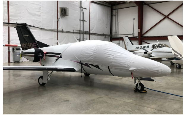
Eclipse EA500 Canopy/Nose Cover, Engine Covers