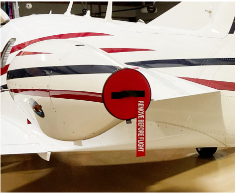
Eclipse EA500 Intake/Exhaust Plugs