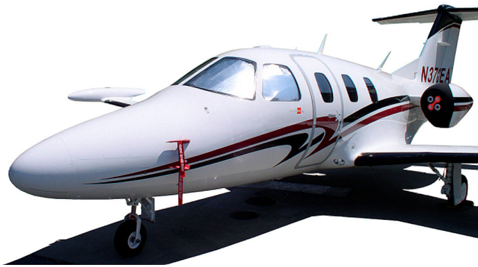
Cockpit HeatShields, Pitot Covers & "Bikini" style Engine Covers