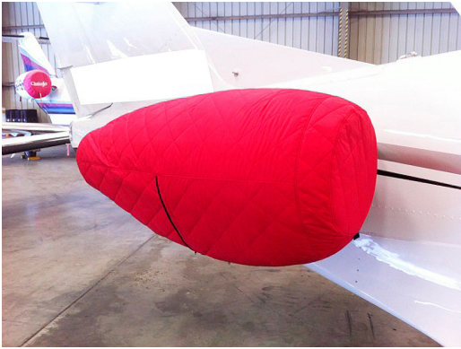
Eclipse Insulated Engine Cover

The Eclipse EA500, TE500, 550 Bikini Style Engine Covers are a single-piece design using a soft and smooth stretchy fabric. The cover stretches tightly over both the intake and exhaust, installing quickly and easily. These covers are designed to be used as hangar dust covers and have a useful life of approximately one year.