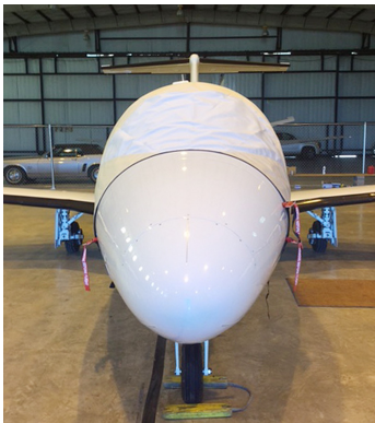
Eclipse Cockpit Door Cover, with Pitot Tube Covers

This cover type is made from Silver Acrylic Sunbrella canvas and is 100% lined with a soft and smooth microfiber. Bruce's Custom Covers developed this material combination especially for aircraft protection. The outer material is medium weight and treated for water resistance, UV resistance and anti-static buildup. The inner lining is a very soft and smooth microfiber to prevent scratching. The material is very reflective, and tests show that the cabin interior temperature can be reduced to near-ambient temperature on the hottest of days. It is water, ice and snow repellent, yet breathable to allow moisture to escape from between the cover and the aircraft surface.