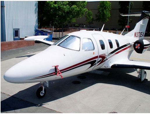
Eclipse Pitot Cover & Bikini Type Engine Covers