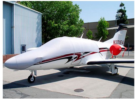
Hangar Dust, Travel Cover & Engine Covers