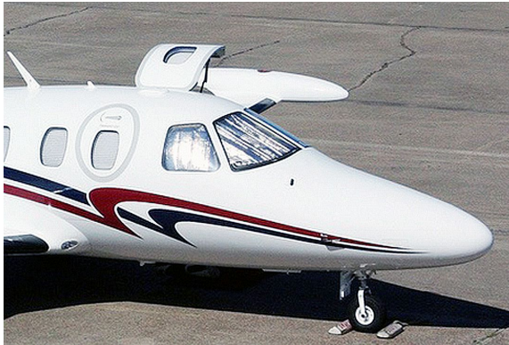
Eclipse Cockpit Heatshields