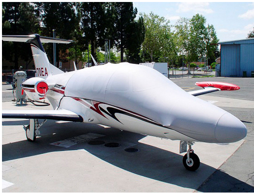
Eclipse Light Weight Travel Cover & Engine Plugs

This cover type is made from Silver Acrylic Sunbrella canvas and is 100% lined with a soft and smooth microfiber. Bruce's Custom Covers developed this material combination especially for aircraft protection. The outer material is medium weight and treated for water resistance, UV resistance and anti-static buildup. The inner lining is a very soft and smooth microfiber to prevent scratching. The material is very reflective, and tests show that the cabin interior temperature can be reduced to near-ambient temperature on the hottest of days. It is water, ice and snow repellent, yet breathable to allow moisture to escape from between the cover and the aircraft surface.