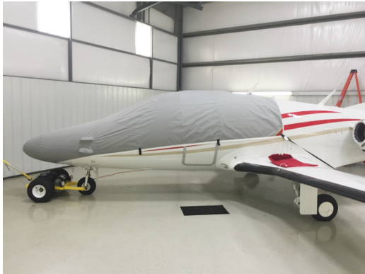
Eclipse Travel Weight Canopy/Nose Cover