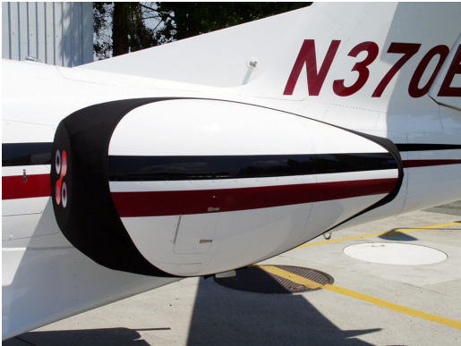
Bikini style Engine Covers