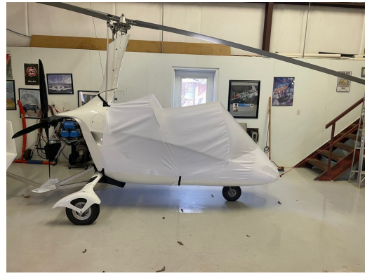
MTO Sport Gyrocopter Canopy/Nose Cover, test fit cover