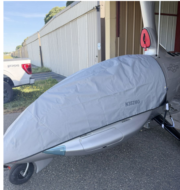
ELA ECLIPSE EVO Travel Weight Canopy/Nose Cover, Rotor Mast Inlet Plug

The Engine Inlet Plugs are custom fit for your ELA Aviation Eclipse, Cougar, Scorpion Gyrocopter intakes, made with heavy-duty vinyl material, and stuffed with a single block of sculpted urethane foam. Each plug has a zipper that allows the foam to be removed and dried if necessary. Engine plugs have 'Remove Before Flight' streamers sewn onto the face of the plugs. Most plugs are imprinted with the aircraft registration number in black for an extra charge. Storage bag NOT included. Engine plugs may be inserted after flight when the engine is still warm. Engine Inlet Plugs are commonly referred to as Cowl Plugs, Intake Plugs, Cowl Blocks, Engine Blocks, and Engine Bunges.