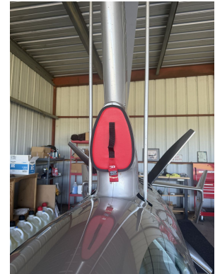
ELA Eclipse EVO Rotor Mast Inlet Plug