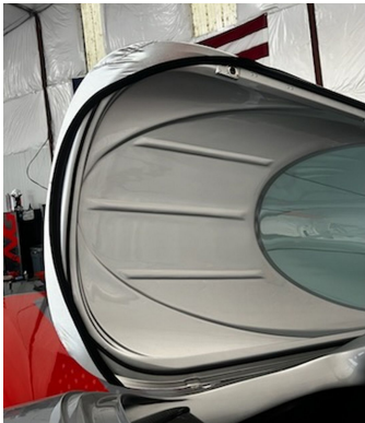
Extra NG Models Canopy Cover (SOLAR CAP EXAMPLE)

Travel Covers are made with Silver Solution-Dyed Polyester fabric and only lined over the windshield to save weight. The material is lightweight and more compact for easy stowage in the aircraft. The polyester material is water resistant, but only intended for occasional use outside. We also have an ultra lightweight material available for fitted hangar dust covers. For daily outdoor use, the non-travel Sunbrella Cover is the best choice.