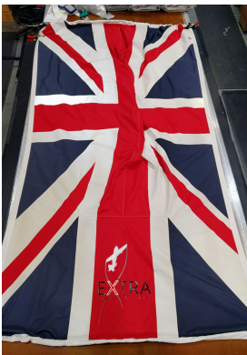
Custom Full-Cover Artwork