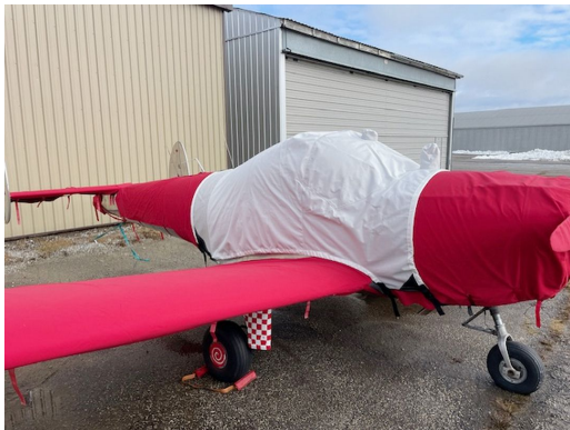
Ercoupe Extended Canopy Cover

This cover type is made from Silver Acrylic Sunbrella canvas and is 100% lined with a soft and smooth microfiber. Bruce's Custom Covers developed this material combination especially for aircraft protection. The outer material is medium weight and treated for water resistance, UV resistance and anti-static buildup. The inner lining is a very soft and smooth microfiber to prevent scratching. The material is very reflective, and tests show that the cabin interior temperature can be reduced to near-ambient temperature on the hottest of days. It is water, ice and snow repellent, yet breathable to allow moisture to escape from between the cover and the aircraft surface.