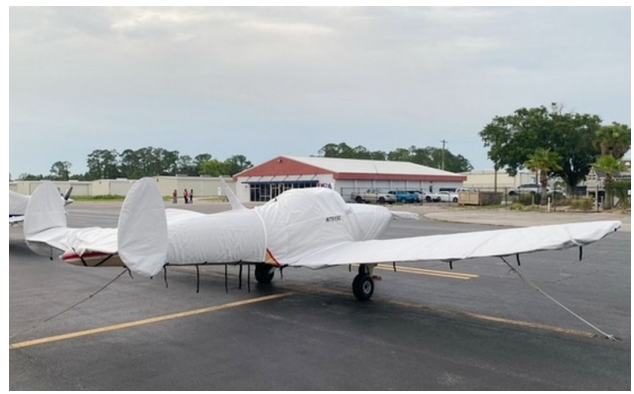
Ercoupe Complete Cover Set