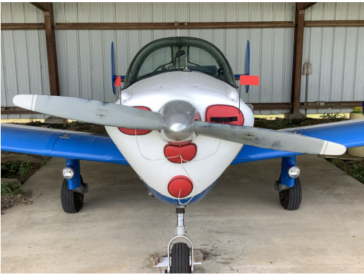
Ercoupe Engine Inlet Plugs