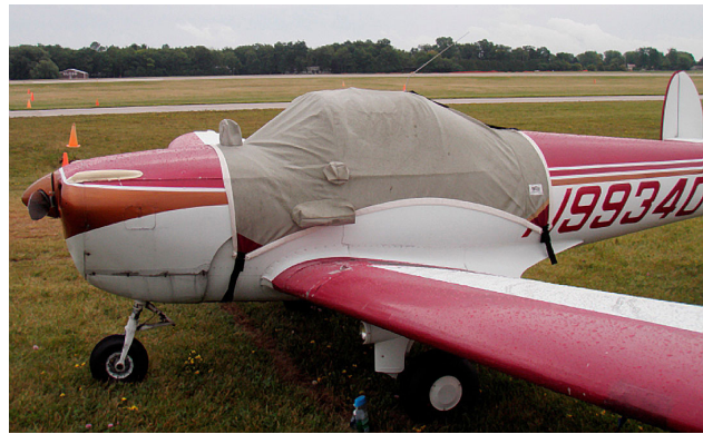
Ercoupe Canopy Cover, flat windshield model