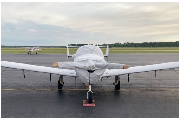
Ercoupe Complete Cover Set

WINTER USE MATERIAL - Made with Solution-Dyed Polyester fabric, this option is intended for seasonal use to aid in deicing, rain mitigation, or for occasional travel. The material is lighter and more compact, but more susceptible to UV damage and may have a shorter useful life if used continuously outside than the all-year use material.