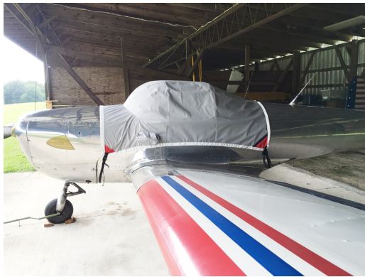
Ercoupe Light Weight Travel Cover

Travel Covers are made with Silver Solution-Dyed Polyester fabric and only lined over the windshield to save weight. The material is lightweight and more compact for easy stowage in the aircraft. The polyester material is water resistant, but only intended for occasional use outside. We also have an ultra lightweight material available for fitted hangar dust covers. For daily outdoor use, the non-travel Sunbrella Cover is the best choice.