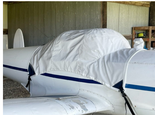
ERCOUPE 415-C Canopy Cover