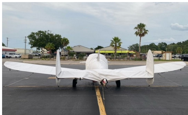
Ercoupe Complete Cover Set