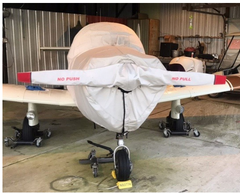
Ercoupe Extended Canopy/Engine & Prop Cover