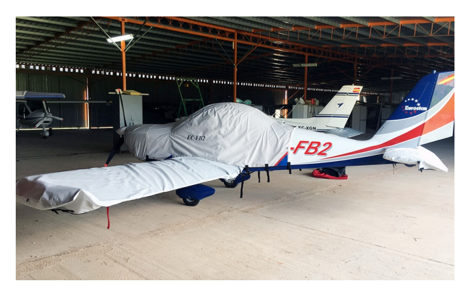
Evektor-Aerotechnik SportStar/Eurostar Wing Covers