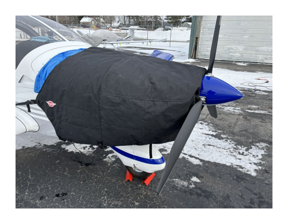
Evektor Harmony Insulated Engine Cover