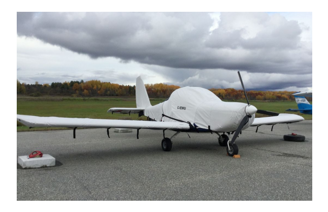
Evektor Sportstar Full Cover Set

shorter useful life if used continuously outside than the all-year use material.