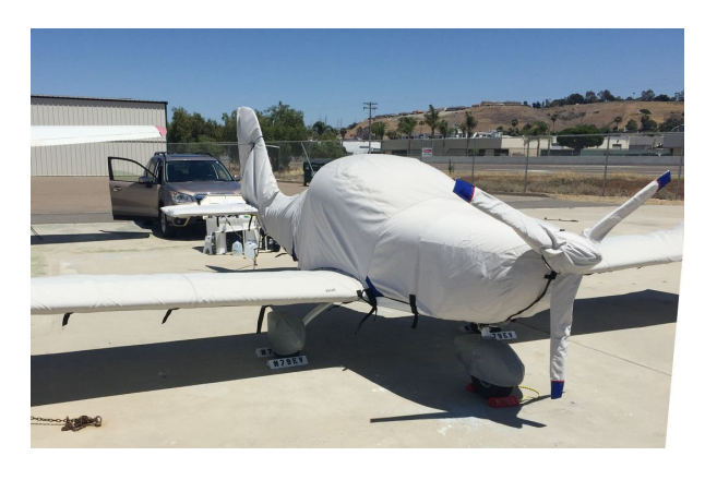
2017 Evector Sportstar Max Extended Canopy/Engine Cover