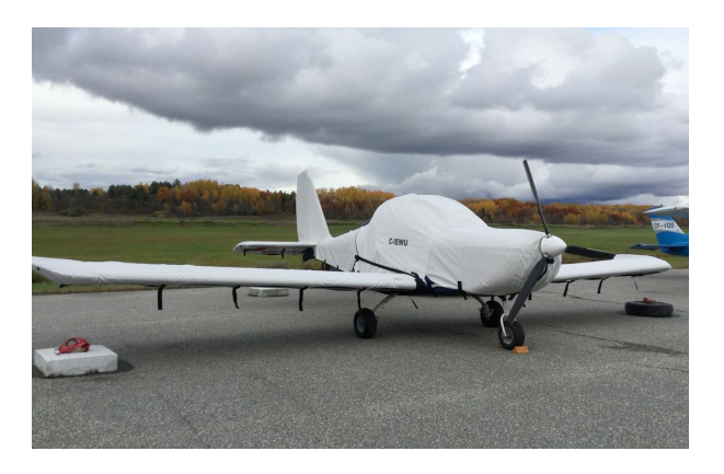
Evektor Sportstar Full Cover Set