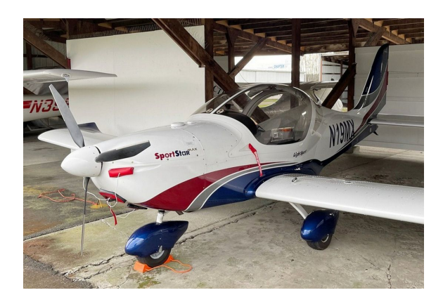
Evektor SportStar Engine & Vent Plugs

Engine Inlet Plugs are custom fit for your Evektor-Aerotechnik SportStar, Eurostar, Max, Harmony intakes, made with heavy-duty vinyl material, and stuffed with a single block of sculpted urethane foam. Each plug has a zipper that allows the foam to be removed and dried if necessary. Engine plugs have warning flags that are visible from the cockpit or 'remove before flight' streamers sewn onto the face of the plugs. Most plugs are imprinted with the aircraft registration number in black for an extra charge. Storage bag NOT included. Engine plugs may be inserted after flight when the engine is still warm. Engine Inlet Plugs are commonly referred to as Cowl Plugs, Intake Plugs, Cowl Blocks, Engine Blocks, and Engine Bungs.