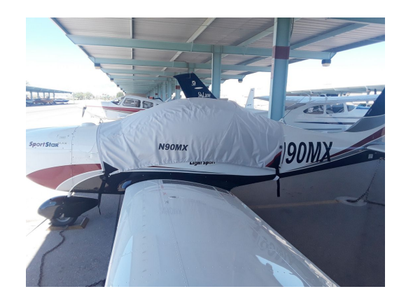
Evektor Sportstar Max Canopy Cover

This cover type is made from Silver Acrylic Sunbrella canvas and is 100% lined with a soft and smooth microfiber. Bruce's Custom Covers developed this material combination especially for aircraft protection. The outer material is medium weight and treated for water resistance, UV resistance and anti-static buildup. The inner lining is a very soft and smooth microfiber to prevent scratching. The material is very reflective, and tests show that the cabin interior temperature can be reduced to near-ambient temperature on the hottest of days. It is water, ice and snow repellent, yet breathable to allow moisture to escape from between the cover and the aircraft surface.