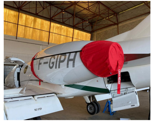
Falcon 10 Engine Covers, no TR's