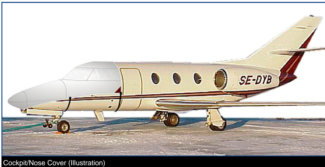
Cockpit/Nose Cover (Illustration)