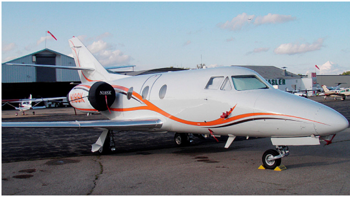
Falcon Jet Engine Intake/Exhaust Cover Set