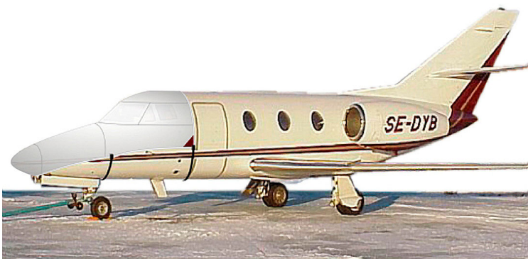
Cockpit/Nose Cover (Illustration)