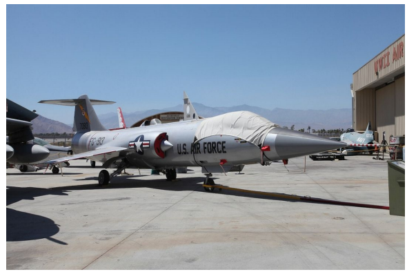
Lockheed F104 Canopy Cover, Intake Plugs