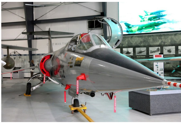
Lockheed F-104 Starfighter Intake Plugs