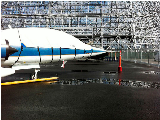
F-104 Tandem Canopy Cover

This cover type is made from Silver Acrylic Sunbrella canvas and is 100% lined with a soft and smooth microfiber. Bruce's Custom Covers developed this material combination especially for aircraft protection. The outer material is medium weight and treated for water resistance, UV resistance and anti-static buildup. The inner lining is a very soft and smooth microfiber to prevent scratching. The material is very reflective, and tests show that the cabin interior temperature can be reduced to near-ambient temperature on the hottest of days. It is water, ice and snow repellent, yet breathable to allow moisture to escape from between the cover and the aircraft surface.