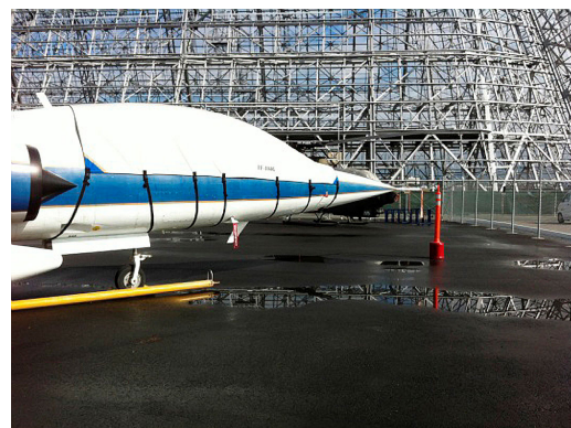
F-104 Tandem Canopy Cover