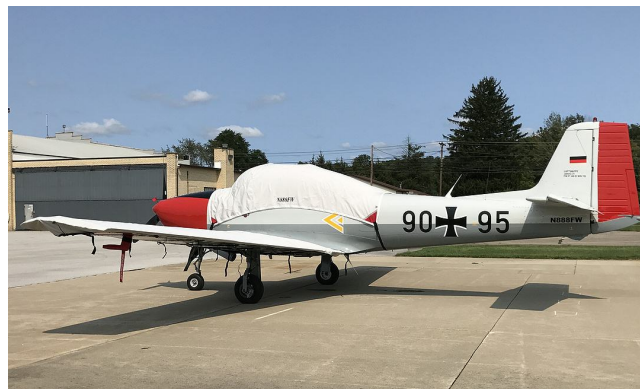
Focke Wulf F149 Canopy Cover, Wing Covers