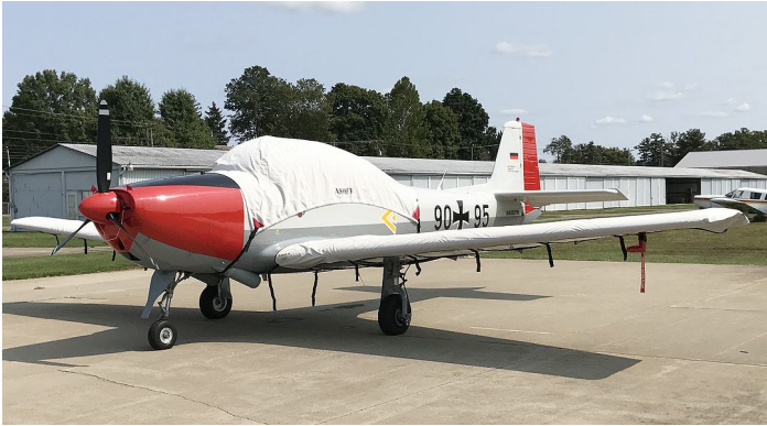
Focke Wulf F149 Canopy Cover, Wing Covers, Engine Plugs