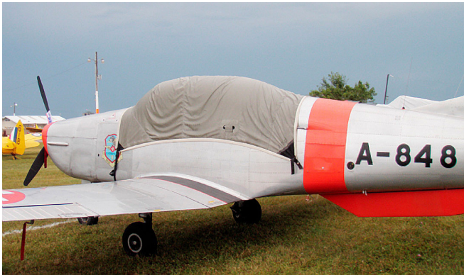
Piaggio P-149D Trainer Canopy Cover

of the Canopy Cover and Engine Cover. This cover will enclose the engine cowl and will extend aft to cover all of the windows. This cover type is made from Silver Acrylic Sunbrella canvas and is 100% lined with a soft and smooth microfiber. Bruce's Custom Covers developed this material combination especially for aircraft protection. The outer material is medium weight and treated for water resistance, UV resistance and anti-static buildup. The inner lining is a very soft and smooth microfiber to prevent scratching. The material is very reflective, and tests show that the cabin interior temperature can be reduced to near-ambient temperature on the hottest of days. It is water, ice and snow repellent, yet breathable to allow moisture to escape from between the cover and the aircraft surface.