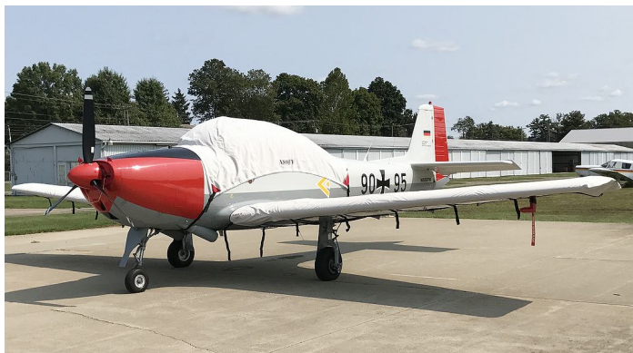
Focke Wulf F149 Canopy Cover, Wing Covers, Engine Plugs

WINTER USE MATERIAL - Made with Solution-Dyed Polyester fabric, this option is intended for seasonal use to aid in deicing, rain mitigation, or for occasional travel. The material is lighter and more compact, but more susceptible to UV damage and may have a shorter useful life if used continuously outside than the all-year use material.