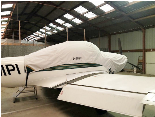
Piaggio FW-149D Canopy/Engine Cover

of the Canopy Cover and Engine Cover. This cover will enclose the engine cowl and will extend aft to cover all of the windows. This cover type is made from Silver Acrylic Sunbrella canvas and is 100% lined with a soft and smooth microfiber. Bruce's Custom Covers developed this material combination especially for aircraft protection. The outer material is medium weight and treated for water resistance, UV resistance and anti-static buildup. The inner lining is a very soft and smooth microfiber to prevent scratching. The material is very reflective, and tests show that the cabin interior temperature can be reduced to near-ambient temperature on the hottest of days. It is water, ice and snow repellent, yet breathable to allow moisture to escape from between the cover and the aircraft surface.