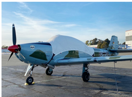
Focke Wulf 149 Trainer Canopy Cover

of the Canopy Cover and Engine Cover. This cover will enclose the engine cowl and will extend aft to cover all of the windows. This cover type is made from Silver Acrylic Sunbrella canvas and is 100% lined with a soft and smooth microfiber. Bruce's Custom Covers developed this material combination especially for aircraft protection. The outer material is medium weight and treated for water resistance, UV resistance and anti-static buildup. The inner lining is a very soft and smooth microfiber to prevent scratching. The material is very reflective, and tests show that the cabin interior temperature can be reduced to near-ambient temperature on the hottest of days. It is water, ice and snow repellent, yet breathable to allow moisture to escape from between the cover and the aircraft surface.