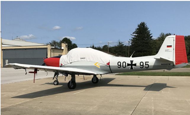
Focke Wulf F149 Canopy Cover, Wing Covers