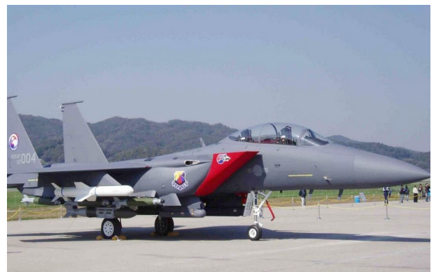
McDonnell Douglas F-15 Eagle Engine Inlet Covers