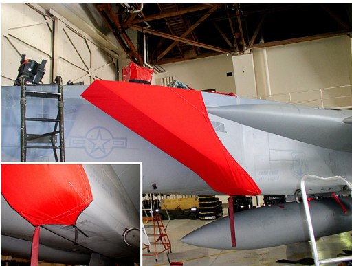
Intake Cover, Attachment Detail (inset)

The McDonnell Douglas F-15 Eagle Intake Covers are designed to install easily yet be completely storable. A spring steel hoop is sewn into the hem of each cover, allowing them to be installed without climbing onto the wing or using a stepladder. To store the covers the spring steel hoop folds like a band-saw blade into three nesting rings. Each cover folds into a compact circular bundle which is stored in the included duffle bag, yet they unfold quickly for use. The Tri-Fold Ring cover is made of medium weight nylon which is available in a variety of colors to match the paint trim. Each cover set comes complete with installation and folding instructions. The aircraft's registration number can be silkscreened onto the cover for an extra charge.