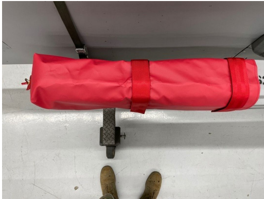
McDonnell Douglas F-15 Launcher Rail Cover

ALL-YEAR USE MATERIAL - Made with Silver Acrylic Sunbrella canvas, the all-year use material is the best option for sun protection and cover longevity. This heavier more durable material is intended for all weather conditions, such as rain and snow or lots of sun.