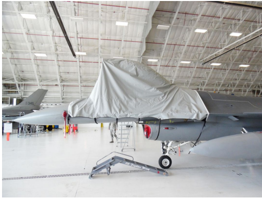
F-16 CANOPY COVER, OPEN POSITION (C-Model, single seat models)

Canopy Covers are commonly referred to as Cabin Covers, Fuselage Covers, Canvas Covers, Canopy Caps, etc.