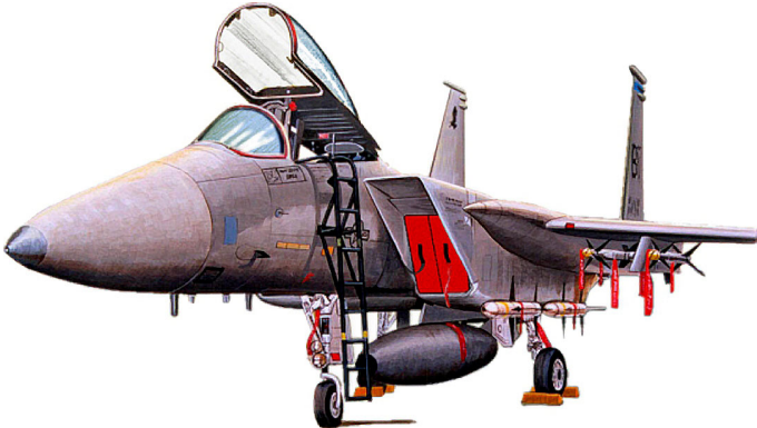
F15 Cockpit HeatShields & Intake Plugs

The Engine Inlet Plugs are custom fit for your McDonnell Douglas F-15 Eagle intakes, made with heavy-duty vinyl material, and stuffed with a single block of sculpted urethane foam. Each plug has a zipper that allows the foam to be removed and dried if necessary. Engine plugs have 'remove before flight' streamers sewn onto the face of the plugs. Most plugs are imprinted with the aircraft registration number in black for an extra charge. Storage bag NOT included. Engine plugs may be inserted after flight when the engine is still warm. Engine Inlet Plugs are commonly referred to as Cowl Plugs, Intake Plugs, Cowl Blocks, Engine Blocks, and Engine Bungs.