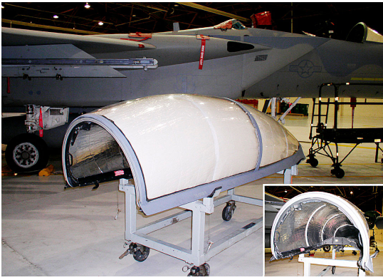
F-15 Cockpit HeatShield