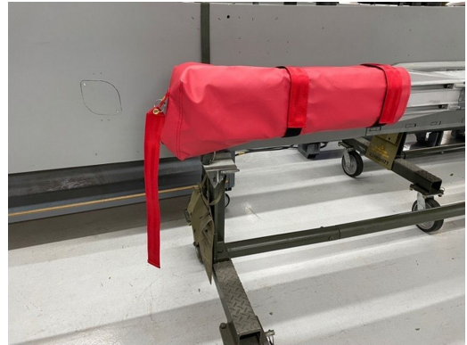
McDonnell Douglas F-15 Launcher Rail Cover