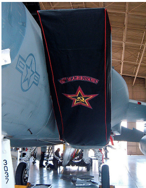
F15 Intake Cover