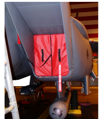
F15 Intake Plugs