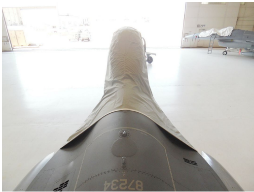
F-16 CANOPY COVER, OPEN POSITION (C-Model, single seat models)