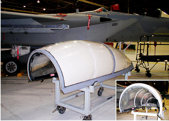
F-15 Cockpit HeatShield

Heatshields are interior sunshades for an aircraft's windows or canopy glass. The product is a unique composite of closed-cell foam with a silver mylar finish. The semi-rigid design is stiff enough to stand along the inside of the windshield using sun visors or window framing. It folds up flat and easily stores in the included storage sleeve. Some designs may require velcro and suction cups. A Heatshield is an excellent short-term remedy for cockpit overheating.