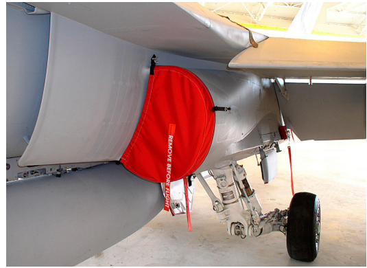
F-18 Engine Inlet Cover