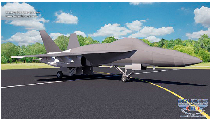
F-18 Storage Covers, 3D rendering