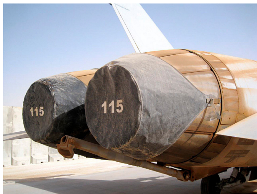
F-18 Exhaust Covers

The McDonnell Douglas F-18 Hornet, Super Hornet Intake Covers are designed to install easily yet be completely storable. A spring steel hoop is sewn into the hem of each cover, allowing them to be installed without climbing onto the wing or using a stepladder. To store the covers the spring steel hoop folds like a band-saw blade into three nesting rings. Each cover folds into a compact circular bundle which is stored in the included duffle bag, yet they unfold quickly for use. The Tri-Fold Ring cover is made of medium weight nylon which is available in a variety of colors to match the paint trim. Each cover set comes complete with installation and folding instructions. The aircraft's registration number can be silkscreened onto the cover for an extra charge.