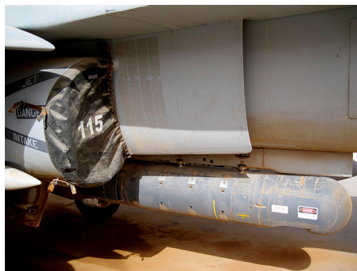
F-18 Intake Covers