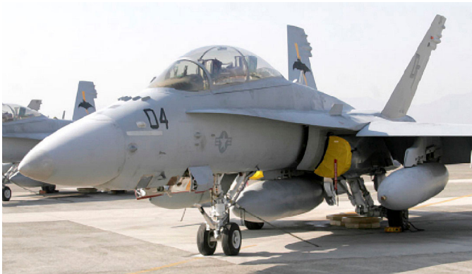
F-18 Intake Cover Set

The McDonnell Douglas F-18 Hornet, Super Hornet Intake Covers are designed to install easily yet be completely storable. A spring steel hoop is sewn into the hem of each cover, allowing them to be installed without climbing onto the wing or using a stepladder. To store the covers the spring steel hoop folds like a band-saw blade into three nesting rings. Each cover folds into a compact circular bundle which is stored in the included duffle bag, yet they unfold quickly for use. The Tri-Fold Ring cover is made of medium weight nylon which is available in a variety of colors to match the paint trim. Each cover set comes complete with installation and folding instructions. The aircraft's registration number can be silkscreened onto the cover for an extra charge.