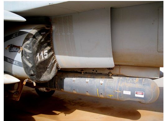
F-18 Intake Covers