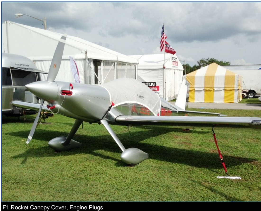
F1 Rocket Canopy Cover, Engine Plugs