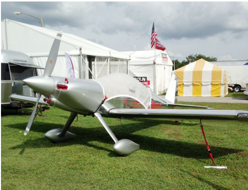
F1 Rocket Canopy Cover, Engine Plugs