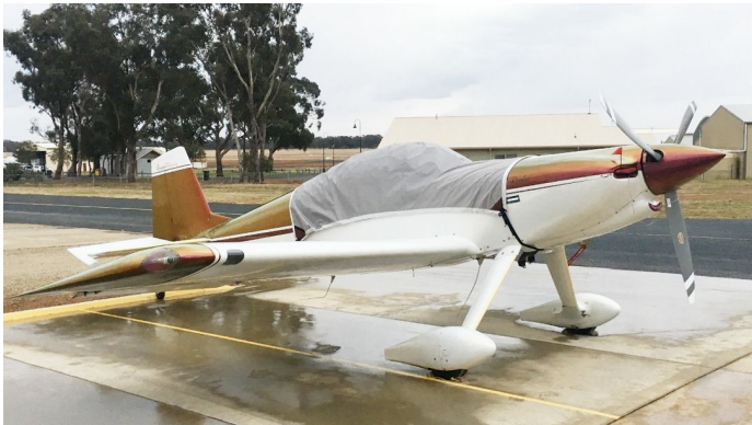
F1 Rocket Travel Cover, Light Weight Travel Canopy Cover, Bubble Windshield, Engine Plugs

Engine Inlet Plugs are custom fit for your Team Rocket F1 Rocket, F4 Raider intakes, made with heavy-duty vinyl material, and stuffed with a single block of sculpted urethane foam. Each plug has a zipper that allows the foam to be removed and dried if necessary. Engine plugs have warning flags that are visible from the cockpit or 'remove before flight' streamers sewn onto the face of the plugs. Most plugs are imprinted with the aircraft registration number in black for an extra charge. Storage bag NOT included. Engine plugs may be inserted after flight when the engine is still warm. Engine Inlet Plugs are commonly referred to as Cowl Plugs, Intake Plugs, Cowl Blocks, Engine Blocks, and Engine Bungs.