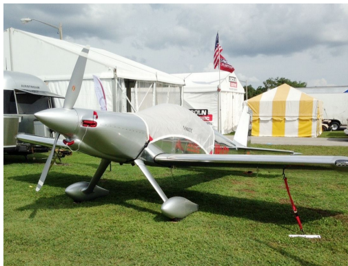
F1 Rocket Canopy Cover, Engine Plugs

This cover type is made from Silver Acrylic Sunbrella canvas and is 100% lined with a soft and smooth microfiber. Bruce's Custom Covers developed this material combination especially for aircraft protection. The outer material is medium weight and treated for water resistance, UV resistance and anti-static buildup. The inner lining is a very soft and smooth microfiber to prevent scratching. The material is very reflective, and tests show that the cabin interior temperature can be reduced to near-ambient temperature on the hottest of days. It is water, ice and snow repellent, yet breathable to allow moisture to escape from between the cover and the aircraft surface.