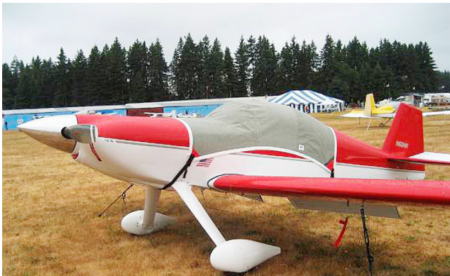
Harmon Rocket Canopy Cover & Engine Inlet Plugs

Travel Covers are made with Silver Solution-Dyed Polyester fabric and only lined over the windshield to save weight. The material is lightweight and more compact for easy stowage in the aircraft. The polyester material is water resistant, but only intended for occasional use outside. We also have an ultra lightweight material available for fitted hangar dust covers. For daily outdoor use, the non-travel Sunbrella Cover is the best choice.