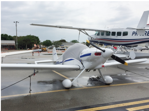
Van's RV-4/Harmon Rocket Travel Cover