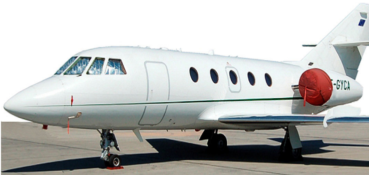
Falcon Engine Cover & Cockpit HeatShields

The Falcon Jet 20 (HU-25) Bikini Style Engine Covers are a single-piece design using a soft and smooth stretchy and fabric. The cover stretches tightly over both the intake and exhaust, installing quickly and easily. These covers are designed to be used as hangar dust covers and have a useful life of approximately one year.