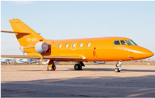
Falcon Engine Covers

The Falcon Jet 20 (HU-25) Bikini Style Engine Covers are a single-piece design using a soft and smooth stretchy and fabric. The cover stretches tightly over both the intake and exhaust, installing quickly and easily. These covers are designed to be used as hangar dust covers and have a useful life of approximately one year.