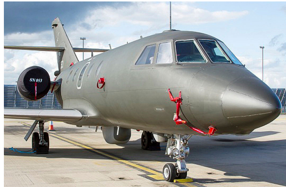
Falcon Engine Covers (not our probe covers)

The Falcon Jet 20 (HU-25) Intake/Exhaust Plugs are custom fit for the intake and exhaust openings, made with heavy-duty vinyl material, and stuffed with a single block of sculpted urethane foam. Each plug has a zipper that allows the foam to be removed and dried if necessary. Engine plugs have 'remove before flight' streamers sewn onto the face of the plugs. Most plugs are imprinted with the aircraft registration number in black. Engine plugs may be inserted after flight when the engine is still warm. Engine Inlet Plugs are commonly referred to as Cowl Plugs, Intake Plugs, Cowl Blocks, Engine Blocks, and Engine Bungs.