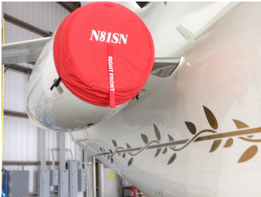
Falcon 900EX Intake Cover