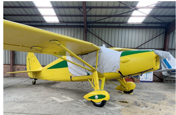
Fairchild 24 Over-Top Canopy Cover, Prop Cover