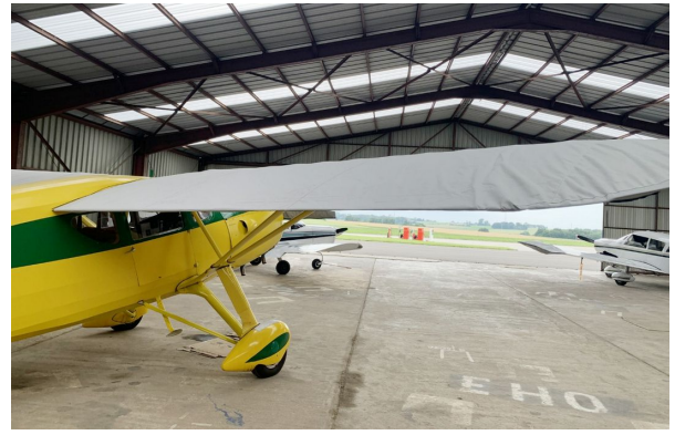
Fairchild 24 Wing Covers