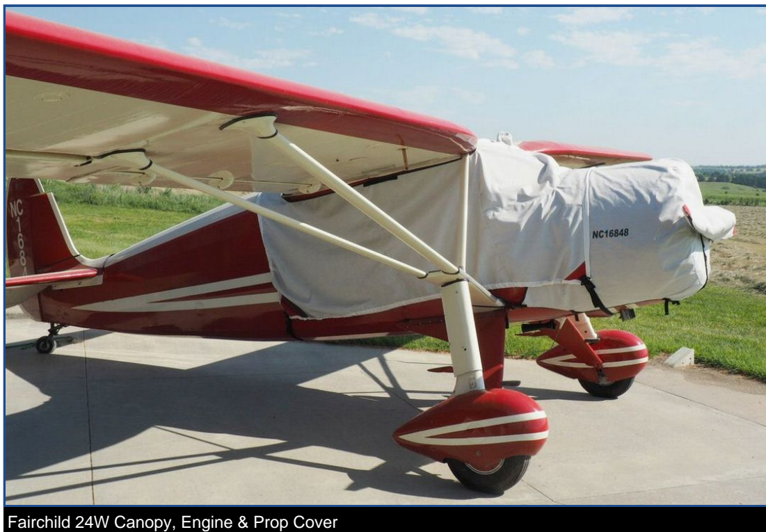
Fairchild 24W Canopy, Engine &amp; Prop Cover