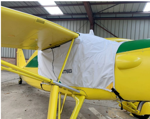
Fairchild 24 Over-Top Canopy Cover

Travel Covers are made with Silver Solution-Dyed Polyester fabric and only lined over the windshield to save weight. The material is lightweight and more compact for easy stowage in the aircraft. The polyester material is water resistant, but only intended for occasional use outside. We also have an ultra lightweight material available for fitted hangar dust covers. For daily outdoor use, the non-travel Sunbrella Cover is the best choice.