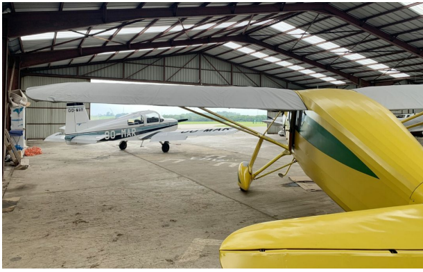
Fairchild 24 Wing Covers