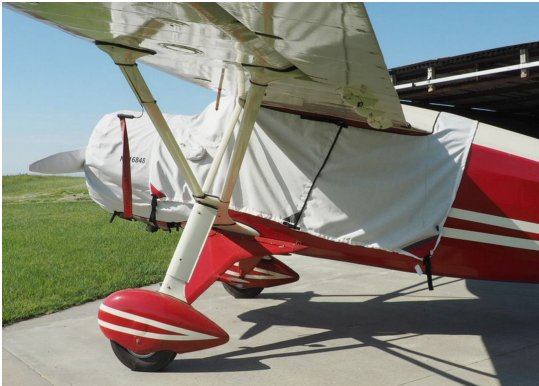
Fairchild 24W Canopy & Engine Cover