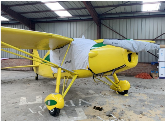
Fairchild 24 Over-Top Canopy Cover