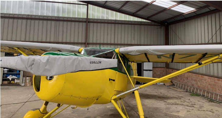
Fairchild 24 Wing & Prop Covers

This cover type is made from Silver Acrylic Sunbrella canvas and is 100% lined with a soft and smooth microfiber. Bruce's Custom Covers developed this material combination especially for aircraft protection. The outer material is medium weight and treated for water resistance, UV resistance and anti-static buildup. The inner lining is a very soft and smooth microfiber to prevent scratching. The material is very reflective, and tests show that the cabin interior temperature can be reduced to near-ambient temperature on the hottest of days. It is water, ice and snow repellent, yet breathable to allow moisture to escape from between the cover and the aircraft surface.